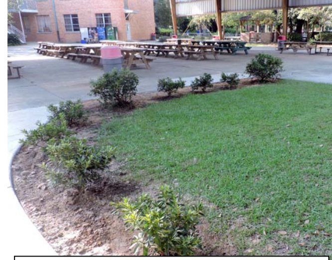
The new azaleas make the new gym area even more attractive. Thanks, Key Club, for your efforts.