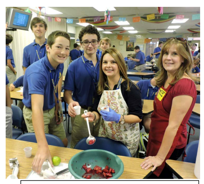
Spanish Dept serves up cactus fruit.

The 10th, 11th and 12th graders will have their Homecoming dance on Saturday, October 1 from 7-10PM in the Briggs Assembly Center. Dance registration forms are available in room 107 or on Edline or the school website and are due along with payment on Wednesday, September 28.