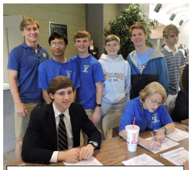
Wolves prepare to welcome matheletes at the recent Saint Paul's Math Tournament