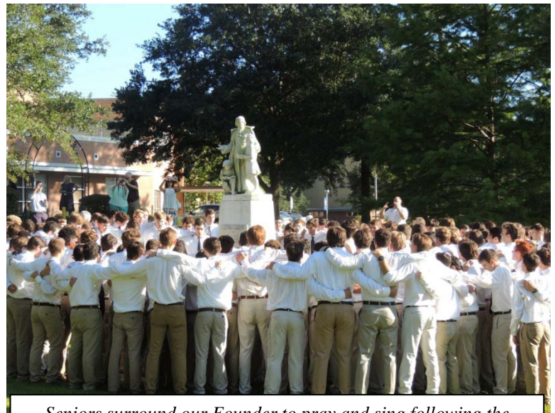
Seniors surround our Founder to pray and sing following the March through the Arch