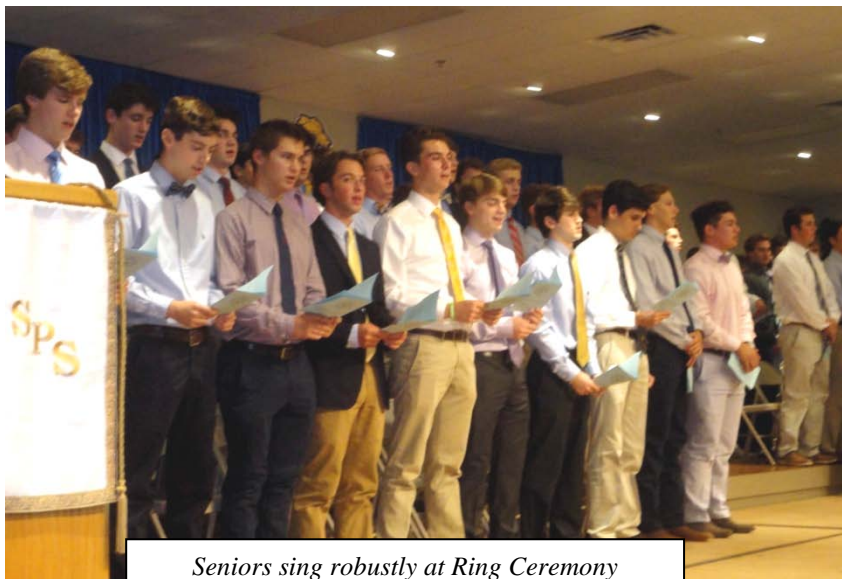
Seniors sing robustly at Ring Ceremony

People are often unreasonable, irrational, and self-centered. Forgive them anyway If you are kind, people may accuse you of selfish, ulterior motives. Be kind anyway. If you are successful, you will win some unfaithful friends and genuine enemies. Succeed anyway.