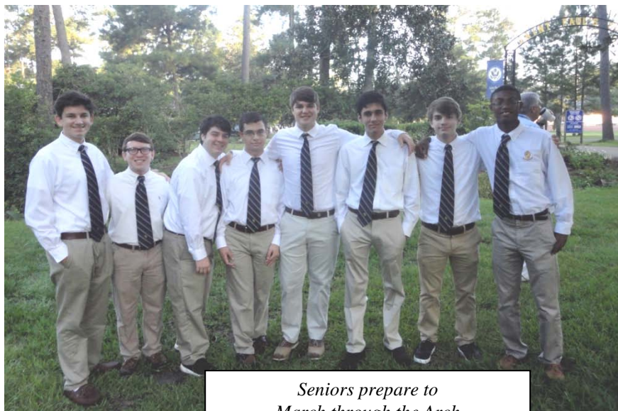
Seniors prepare to March through the Arch