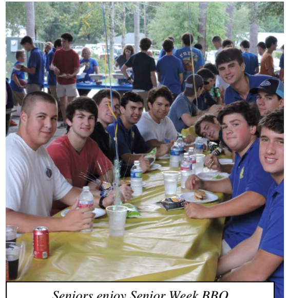
Seniors enjoy Senior Week BBQ

All School Mass on Thursday – DRESS UNIFORM Required Parents Invited!