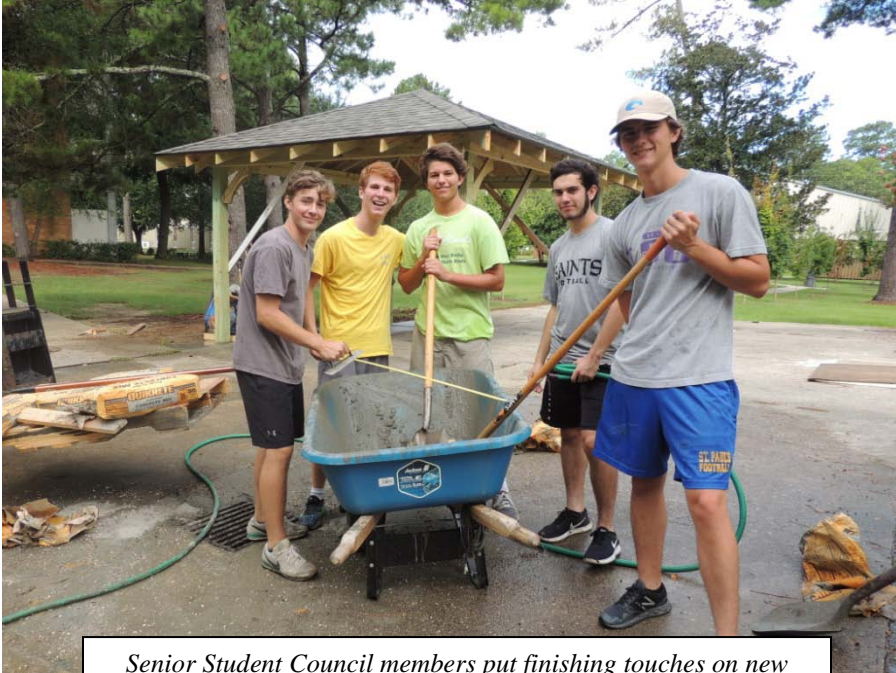
Senior Student Council members put finishing touches on new cafeteria serving pavilion.

New Parent Reception / Information Meeting: A welcome reception and information meeting for new parents will be held on Monday, August 15, at 6:30 pm in the Briggs Assembly Center. More information will be emailed in early August. We hope you have this on your calendar and that you will be with us!