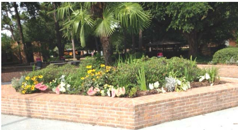
Flora beautify Founders Circle, thanks to the Botanical Wolves.