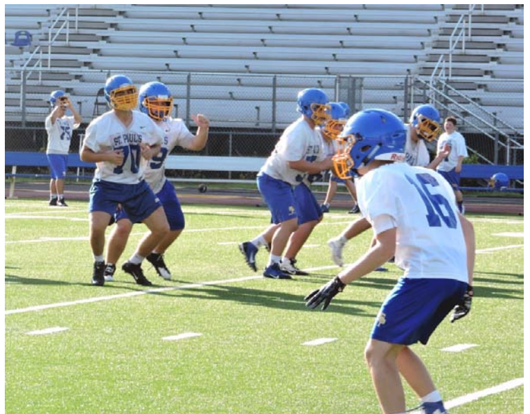
This was the scene each M, W & F morning at 7 am this summer as the Gridiron Wolves anticipate the 2016 season!