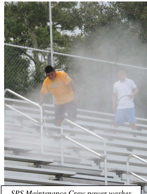
SPS Maintenance Crew power washes stadium to prepare for 2016 season.