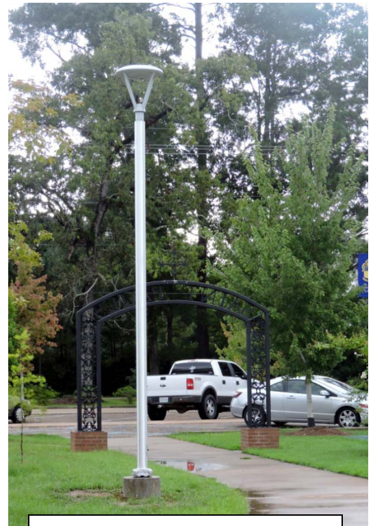
Four additional campus security lights were installed this summer.