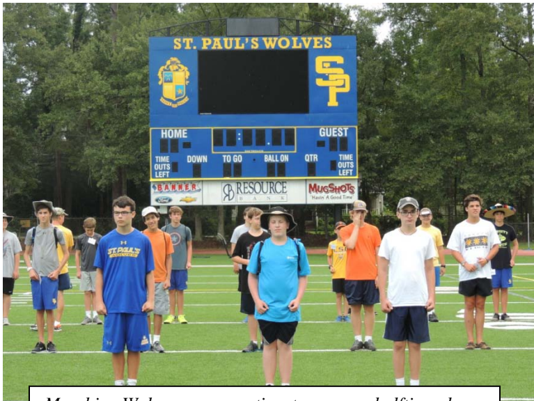
Marching Wolves use camp time to prepare halftime shows this football season.

Should you list an email address, you receive an email confirmation that your application has been submitted. If you have any questions regarding Online Applications, please contact (504)596-3440 or (504)596-3434. Meal eligibility applications should be received prior to the 30 th day of school or current meal benefits may change. Students may also receive a free lunch by offering to help serve lunch during the lunch period.