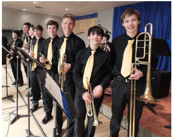
SPS Jazz Band members wow the crowd at Celebrity Waiters Dinner on Thursday night!

Scripture tells us that God's ways are not our ways. Could there be a more relevant example of how God brings good out of evil, strength out of weakness, salvation out of despair? Could the Hand of God be any more obvious in our school's existence? Could we have any doubt that our work today is God's work -- a continuation of that miraculous journey to Covington, those incredible stories of heroic men giving their lives for the sake of Lasallian Mission?