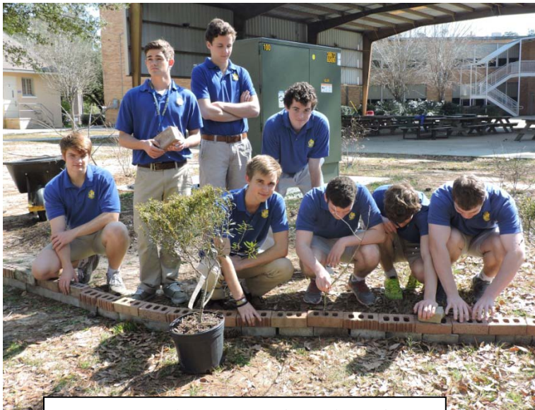
Env Sci Wolves construct butterfly garden