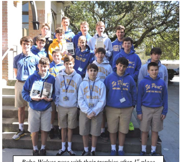
Robo-Wolves pose with their trophies after 1 st place win at recent competition.