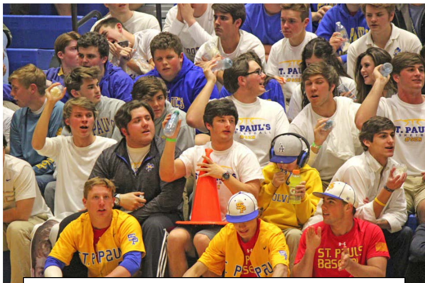
Students cheer BB Wolves to victory in playoff game.

Welcome to March: It’s hard to believe we have reached March! 17% (OK, only 16.66666...%) if you want to be technical about it) of 2016 is over. And only two more weeks exist in the third quarter! Time is flying by! Seniors have only ten weeks left in their SPS careers! The month of March is named for the Roman god of war, Mars (Ares in the Greek mythological system.) March is National Irish American Month, Music in our Schools Month, National Craft Month, National Frozen Food Month, National Nutrition Month, National Peanut Month, National Women’s History Month, Red Cross Month, and Social Workers Month. Enjoy March!