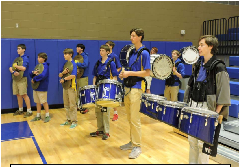
Percussion Wolves prepare to ignite students at Friday's pep rally.