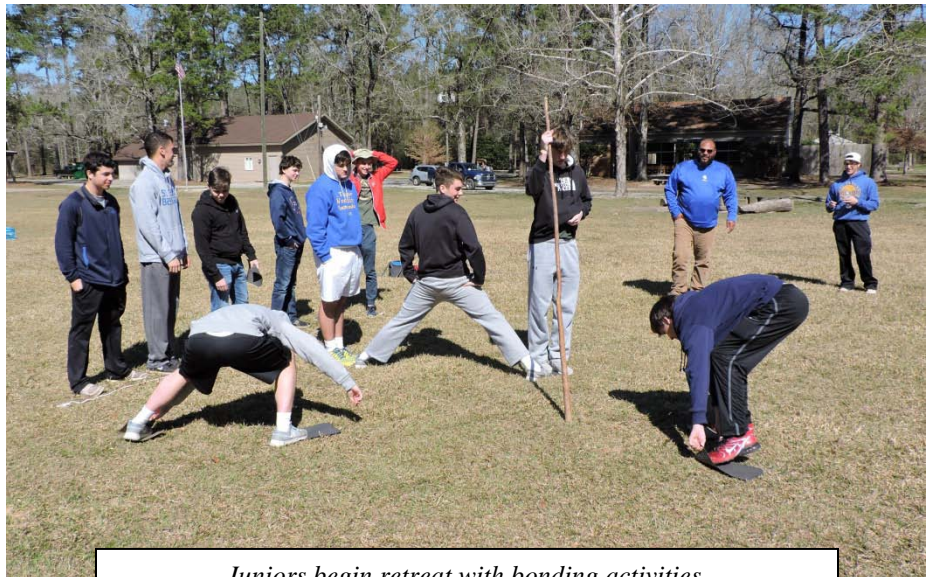
Juniors begin retreat with bonding activities.