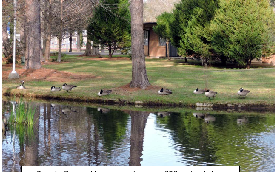
Canada Geese add even more beauty to SPS as they help us reflect on the meaning of Lent....

John Baptist De La Salle encouraged the first teachers to enter fully into Lent. While fasting from meat is a Lenten practice, the founder encouraged fasting with one's eyes, tongue and heart. With your eyes by "turning aside from whatever might distract you." With your tongue you control what you say so that you only build up instead of tear down. And with your heart, you surrender your will to God's so that you open it others.