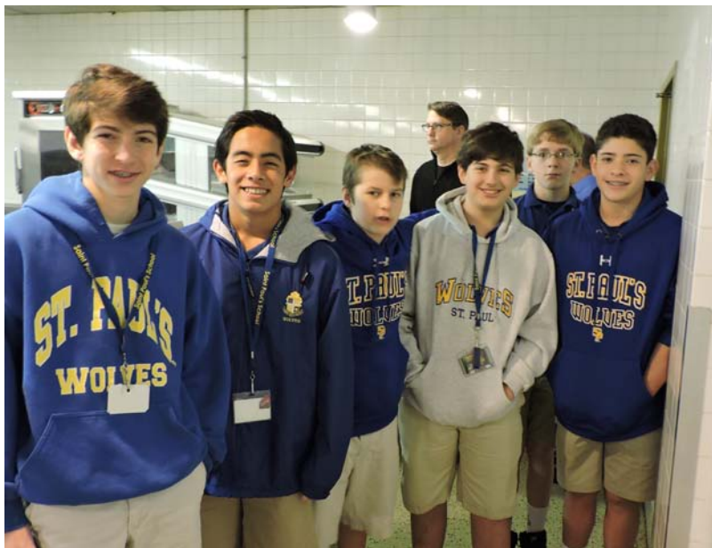
Hungry pre-freshmen await start of serving at Honor Roll Breakfast – I'm sure they were hungry for the vocabulary words, too, that were taught at the breakfast!

Sweatshirts & Cold Weather: With the exceptionally cold weather last week, we relaxed our rule and allowed heavy coats and other warm weather gear. Now that things are more seasonal, we return to policy: ONLY SPS cold weather wear is accepted. If this presents a problem, please contact me. We have some pre-owned sweatshirts in good condition which I'll be happy to distribute. Nothing will be done to embarrass your son.