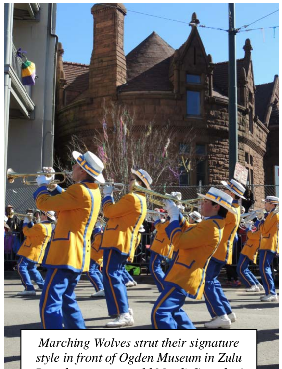
Marching Wolves strut their signature style in front of Ogden Museum in Zulu Parade on a very cold Mardi Gras day!