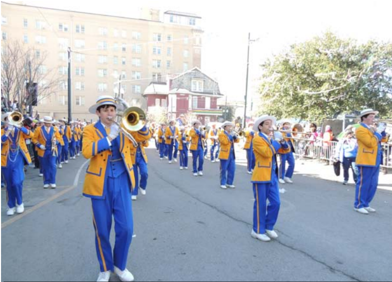
Marching Wolves were crowd pleasers at seven Mardi Gras parades this season! Here they are in Zulu!

School Zone Cell Phone Ban: It is illegal to use a cell phone in a school zone while driving. I see some students and parents driving in the morning and using a cell phone. This sets a bad example – and is illegal. Please do not drive on campus during school zone hours while using a cell phone.