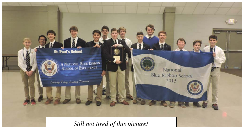
Still not tired of this picture!

...by doing ordinary things extraordinarily well, making courageous choices, and doing God’s will!