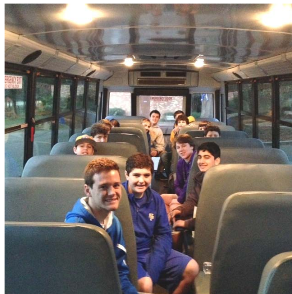
Fighting Math Wolves smile as they prepare to head to Baton Rouge at 7am on Saturday!