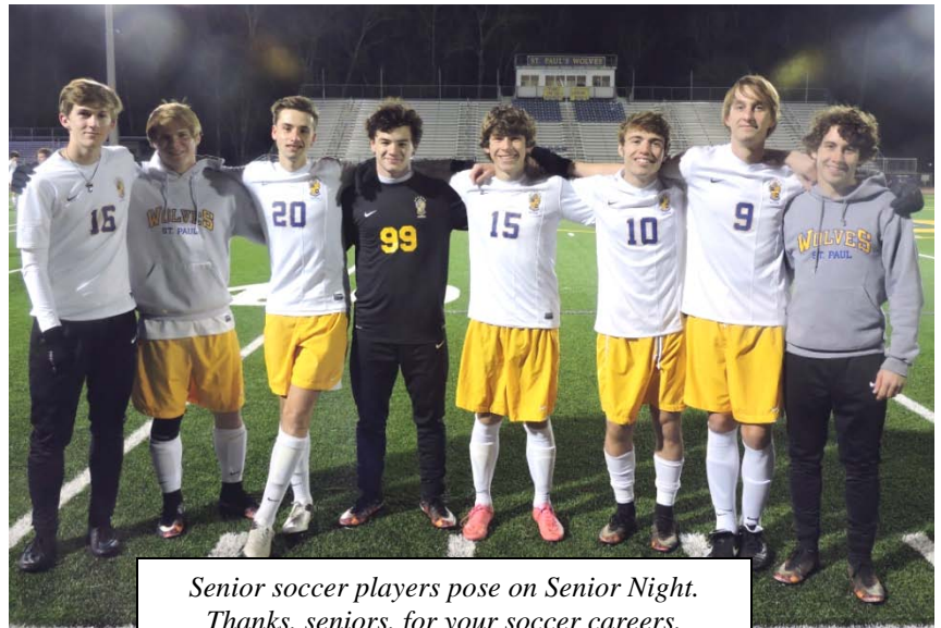
Senior soccer players pose on Senior Night. Thanks, seniors, for your soccer careers.