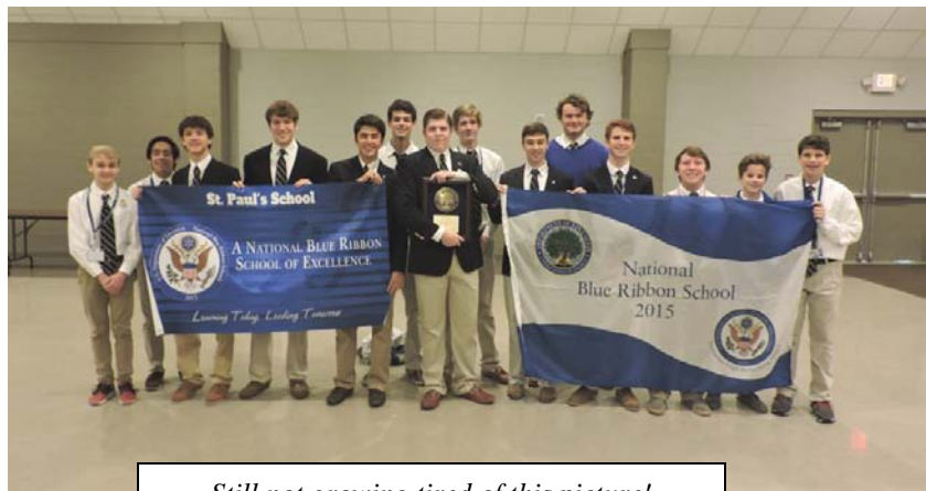
Still not growing tired of this picture!