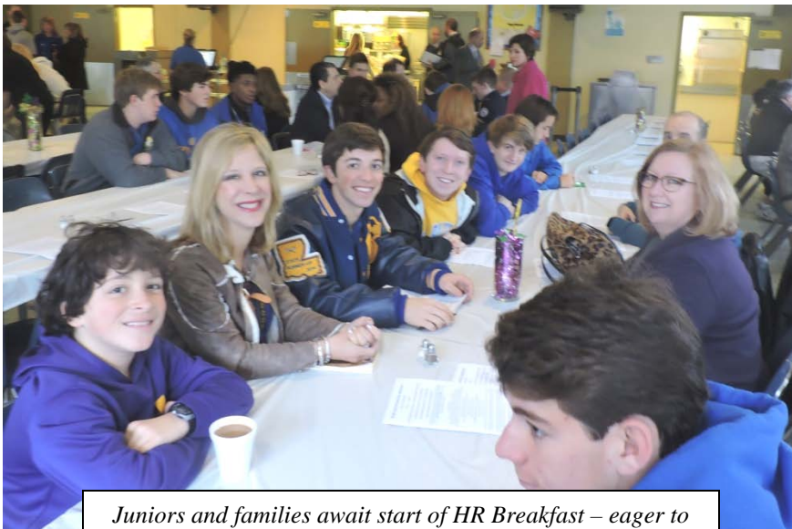
Juniors and families await start of HR Breakfast – eager to learn more vocabulary!