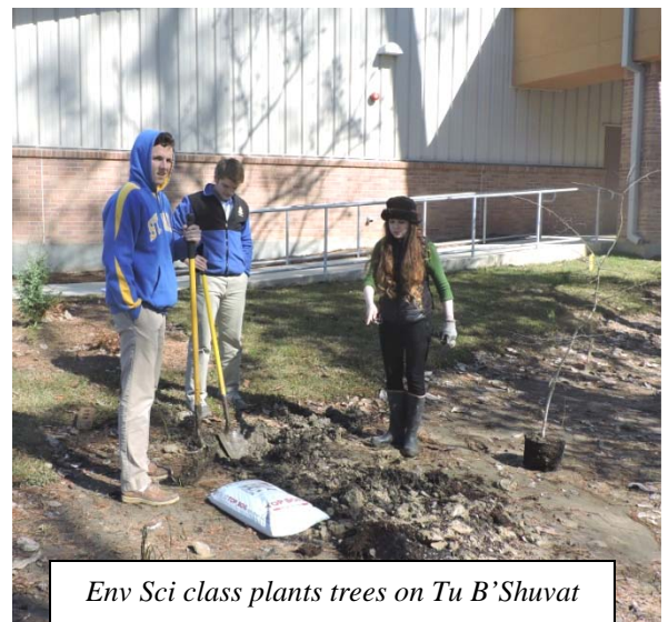
Env Sci class plants trees on Tu B'Shuvat

Tu B'shuvat: Last Monday, Jan 25, while we Catholics celebrated the Feast of the Conversion of Saint Paul, our Jewish brothers and sisters celebrated Tu B'shuvat, the Jewish New Year for Trees Day. This is the season in which the earliest-blooming trees in the Land of Israel emerge from their winter sleep and begin a new fruit-bearing cycle. Our Jewish brothers and sisters mark the day of Tu B'Shevat by eating fruit, particularly from the kinds that are singled out by the Torah in its praise of the bounty of the Holy Land: grapes, figs, pomegranates, olives and dates. On this day we remember that "man is a tree of the field" (Deut 20:19), and reflect on the lessons that trees can teach us. Here's a New Year's "examination of conscience check list" for trees: