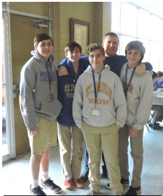
Freshmen gather for HR breakfast