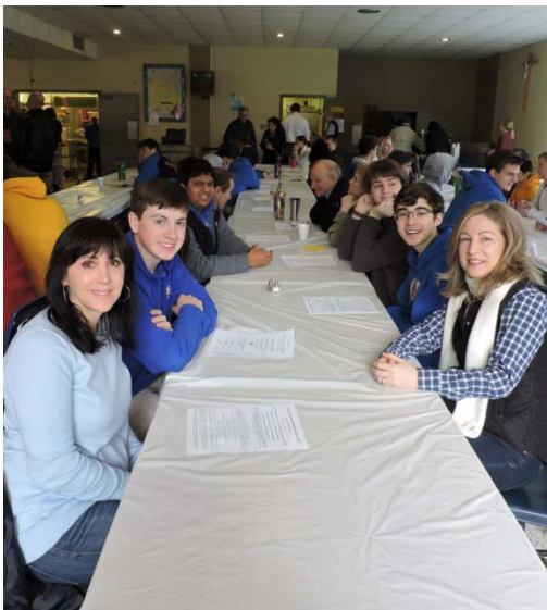
Sophomores await start of HR Breakfast.

2016 - 17 Registration: Please note the following: