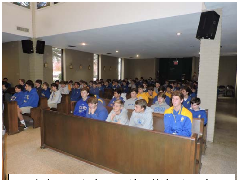
Students practice for mass with Archbishop Aymond.