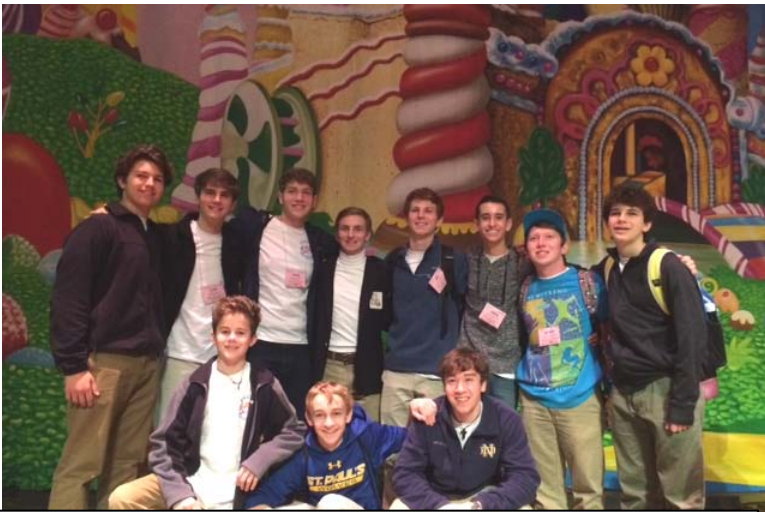
Student Council Wolves at state convention in Pineville

Important Driver's License Requirement: A new requirement was added to the driver's license issuance process for all minor applicants. All minor applicants must produce proof the applicant has either received a diploma or is currently enrolled in a high school program. This is done through a school attendance form from his or her high school prior to applying for a driver's license. These forms can be obtained in the administration building or the counseling center. Several students went for licenses over the holidays and were turned away because they didn't have the form – in some cases they waited several hours before being turned away!