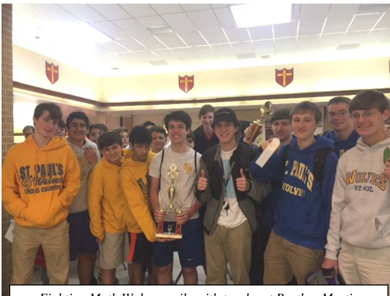
Fighting Math Wolves smile with trophy at Brother Martin Tournament