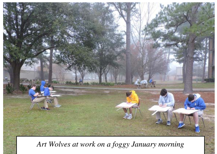
Art Wolves at work on a foggy January morning