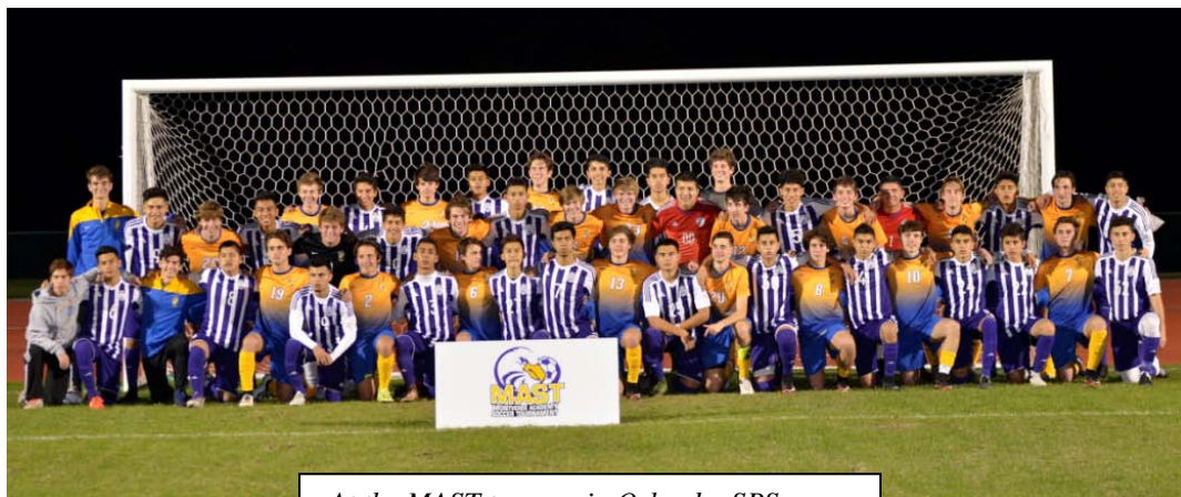
At the MAST tourney in Orlando, SPS poses with soccer team from Cathedral of Los Angeles, a Lasallian school in the San Francisco New Orleans District

January 19 – President's Assembly January 20 – 9 th Grade PLAN Test January 22 – President's Assembly (music practice) January 25 – 9:15 Mass (Conversion of St. Paul) January 26 – 12 th Grade HR Breakfast January 27 – 11 th Grade HR Breakfast January 28 – Career Day – Juniors / 10 th Grade HR Breakfast January 29 – 9 th Grade HR Breakfast February 1 – Late Start- Parent Teacher meetings 5:00-7:00 February 2 – President's Assembly February 3 – Pre Freshmen HR Breakfast February 5 – Faculty Retreat February 6 – ACT on Campus February 16 – Pack Time February 23 – President's Assembly – Teacher Appreciation Lunch February 25-26- Juniors on Retreat/Angola Field Trip March 1 – Pack Time – Snack Day- Freshmen Service/Retreat March 2 – Freshmen Service/Retreat March 5 – SAT on Campus March 7 – St. Joseph Altar (All periods meet) March 8 – President's Assembly March 11 – End of Third Quarter March 15 – ACT for juniors March 21 – Late start for faculty meeting March 22 – President's Assembly March 23 – Passion Play (two lunch schedule)