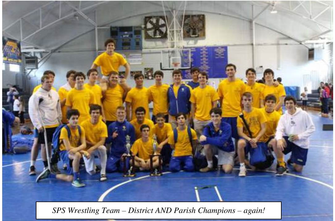
SPS Wrestling Team – District AND Parish Champions – again!