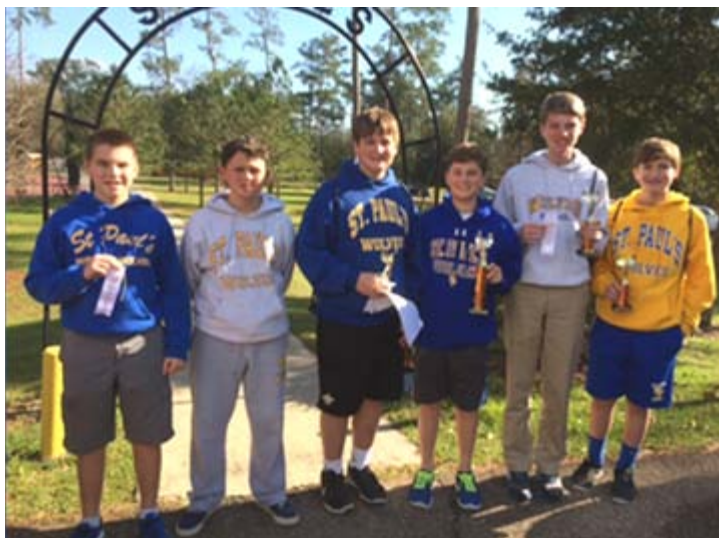
Pre-freshman Fighting Math Wolves return from competition laden with ribbons and trophies! Geaux FMWs!

And the team also beat Ponchatoula on Friday and acquitted itself in an exemplary manner on 94.7 radio last Thu night!