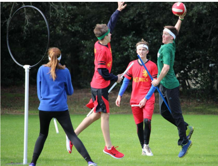
Slytherin dunks in Quiddich game (no, that's not the name of the student! Ask your son if you need an explanation!)

PLEASE – SAFE DRIVING: Parents –let's start 2016 with a resolution for safe driving! Set an example for the students! Students – the neighbors are watching (and filming!) and we will take action! This applies at all times: after school, after practice, on weekends, at games, etc. Please obey the traffic laws: speed limit, no tailgating, no texting while driving, no cell phone use during school zone hours, buckle up, etc. Thank you!