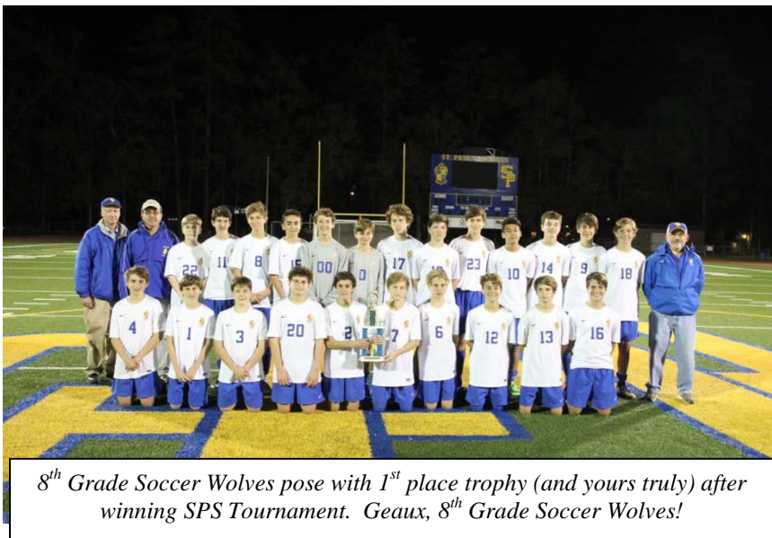
8 th Grade Soccer Wolves pose with 1 st place trophy (and yours truly) after winning SPS Tournament. Geaux, 8 th Grade Soccer Wolves!

of God, we all are called to service. Each and every one of us has our own vocation; and through our vocation, we find our means of grasping the joy of living. My vocation, in this life, happens to be medicine. From my first Biomedical Science class freshman year, to my latest doctor's appointment, I have remained certain that the only way for me to discover fulfillment in this world is through spending my life helping to save theirs. The thought of any other profession poisons my happiness. I want to love the life I live; and medicine saves me from the plague of mere existence. I want to be a physician because I want to spend my life serving others and medicine is the only opportunity I see logical and instinctive. I know with every