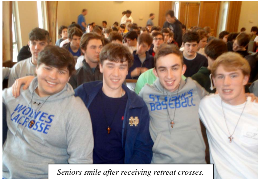
Seniors smile after receiving retreat crosses.