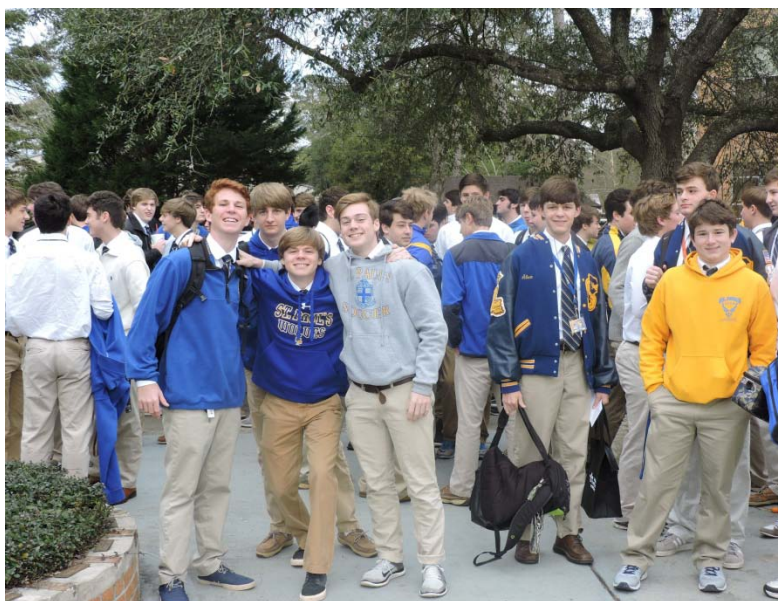
Juniors prepare to leave for WW II Museum field trip, where they represented SPS exemplarily – and learned some history, too!

Right to Life March: A number of Wolves will travel to Washington, DC this week with other students from the Archdiocese of NO to participate in this annual event. Their absences