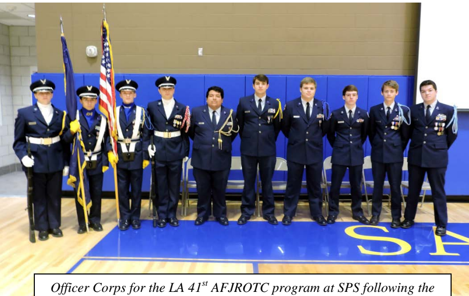
Officer Corps for the LA 41 st AFJROTC program at SPS following the Veterans Day ceremony last week!