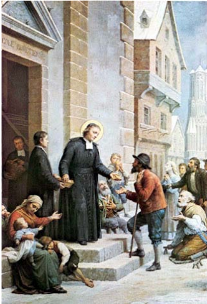
St. La Salle distributes bread to the poor of his day.

In school & country, we are blessed with abundance. And so my final pre-Thanksgiving message concerns the same one I give each year at this time: the Lasallian commitment to the poor.