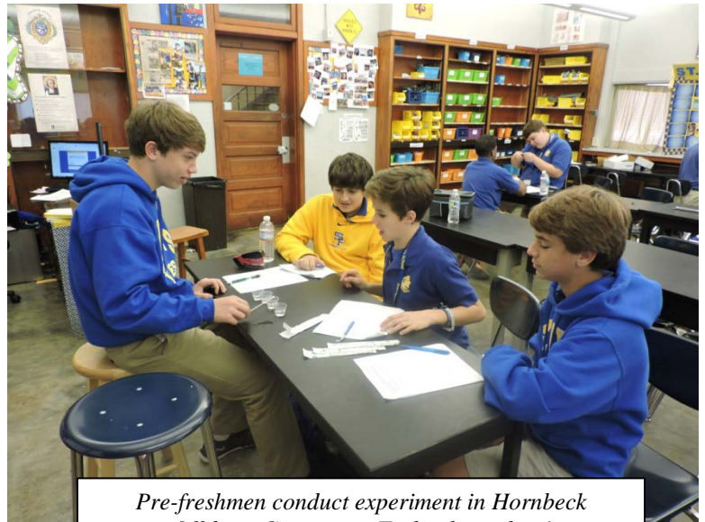
Pre-freshmen conduct experiment in Hornbeck Offshore Gateway to Technology class!