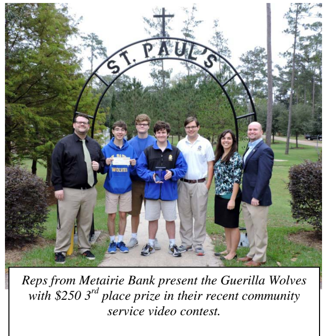
Reps from Metairie Bank present the Guerilla Wolves with $250 3 rd place prize in their recent community service video contest.