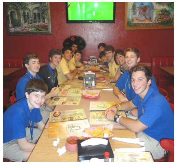
Spanish club enjoys Mexican lunch after successful Dia de los Muertos ceremony.