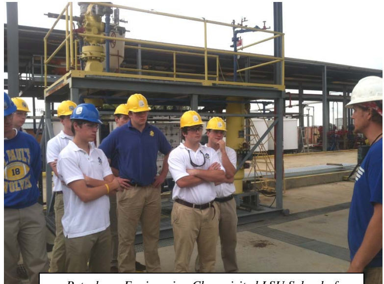
Petroleum Engineering Class visited LSU School of Petroleum Engineering last week.

Quote of the Week: The Church's first duty is not to hand down condemnations or anathemas, but to proclaim God's mercy, to call to conversion, and to lead all men and women to salvation in the Lord. -- Pope Francis in his closing remarks on the recent Synod on the Family