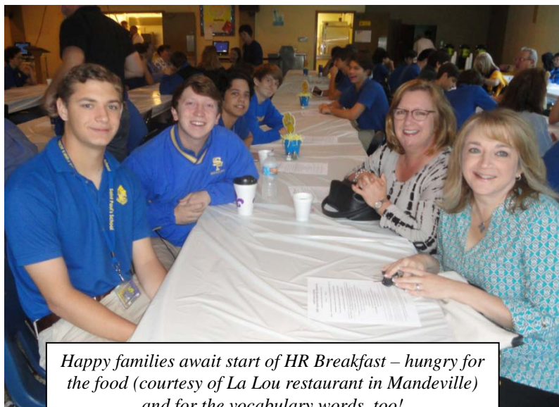
Happy families await start of HR Breakfast – hungry for the food (courtesy of La Lou restaurant in Mandeville) and for the vocabulary words, too!

Food Drive: Student Council is hosting its annual Food Drive to benefit the Covington Food Bank. The drive began Mon, Nov 2 and runs until Tue, Nov 17. Students may bring non perishable goods to their classrooms for collection. Items that are requested include: canned fruit and vegetables, dried beans, rice, cake mix, pasta, canned meats,