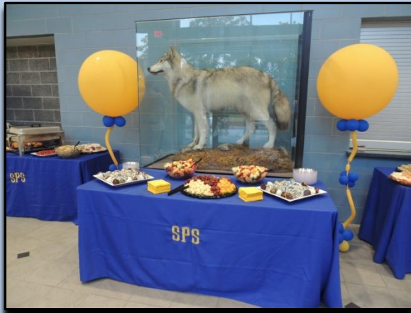
The grey wolf is now front and center in the new gymnasium.