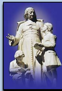
Saint John Baptist de La Salle