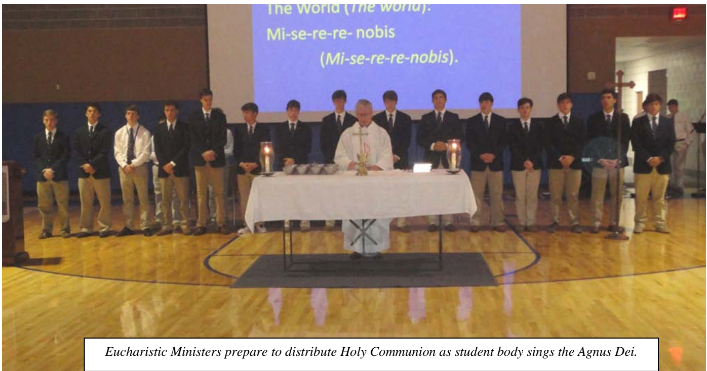
Eucharistic Ministers prepare to distribute Holy Communion as student body sings the Agnus Dei.