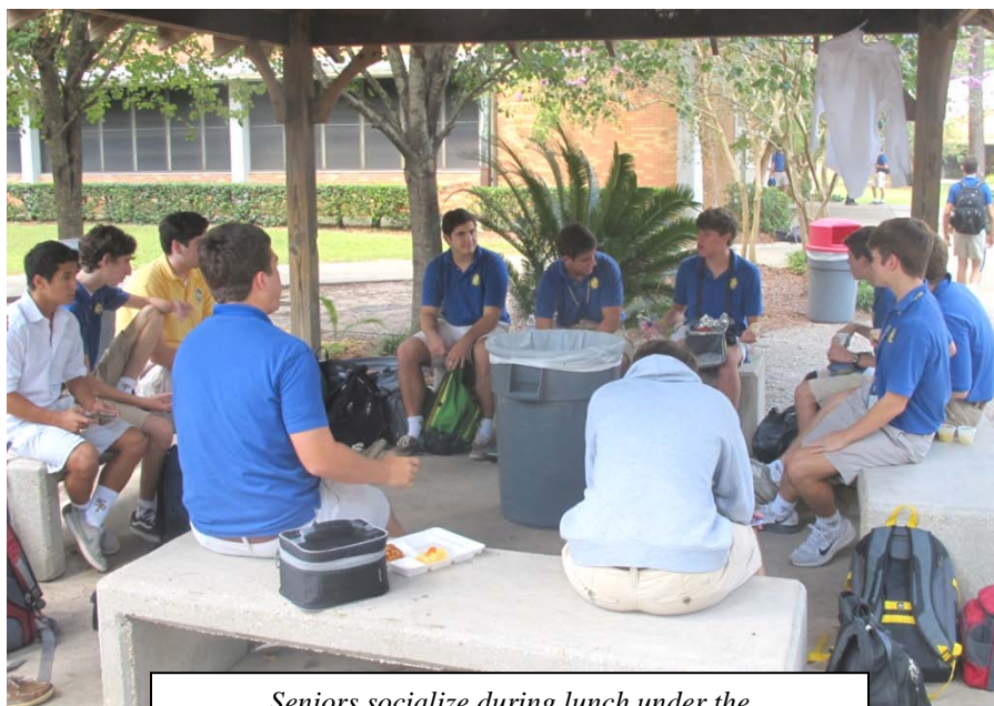
Seniors socialize during lunch under the Matthew Booth Memorial Pavilion