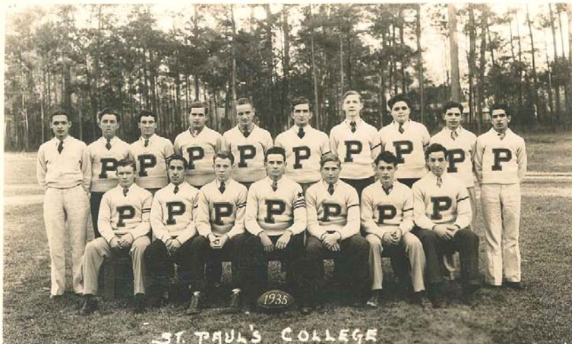
SPS Football Team of 1935 – the first team to play Covington High! Wolves won, 19 – 6! The tradition continues today!