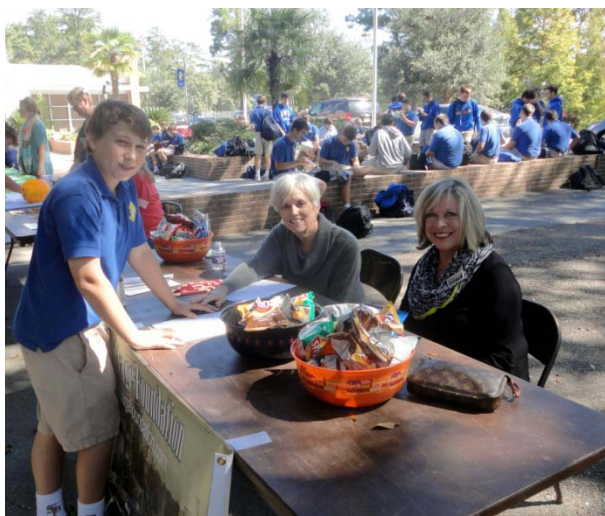
Reps from the Covington Heritage Foundation speak with a student about volunteering during last week's Service Expo.

Sun, Oct 25 – We encourage our Catholic families to attend mass today and our non-Catholic families to attend the place of worship of their choice.