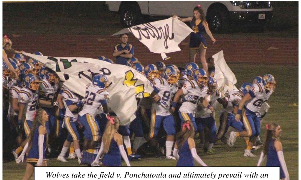
Wolves take the field v. Ponchatoula and ultimately prevail with an exciting OT win!

IMPORTANT! PLEASE HELP: The future of SPS depends on a healthy enrollment. On Saturday, Oct 31 at 1 pm, we will hold our annual Open House for prospective students. Please invite any interested family to attend. This year, we want to send postcard announcements to families. If you know of a family with a son who would benefit from SPS, please email me their name and address. We will mail them a postcard invite. In the past, you, our parents, have been the best source of attracting students to SPS. Please help me now. Again, just send me names and addresses – all we'll send them is a simple postcard. Thanks!