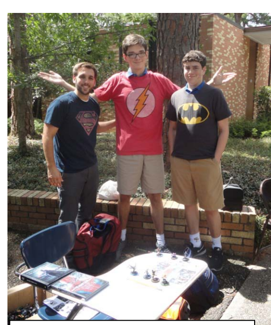
Comic Book Club recruits new members on Get Involved Day!

We offer our support and understanding to the Covington High School Community as they react to the emergency medical