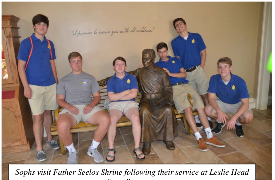
Sophs visit Father Seelos Shrine following their service at Leslie Head Start Program.