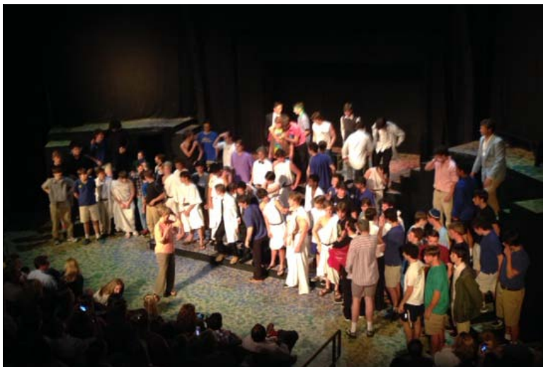
Drama classes receive applause at conclusion of their original one-act plays last week. The plays were written, produced, and directed by the boys. Bravo!

There was a little turtle. He lived in a box. He swam in a puddle. He climbed on the rocks. He snapped at a mosquito. He snapped at a flea. He snapped at a minnow. And he snapped at me. He caught the mosquito. He caught the flea. He caught the minnow. But he didn't catch me.