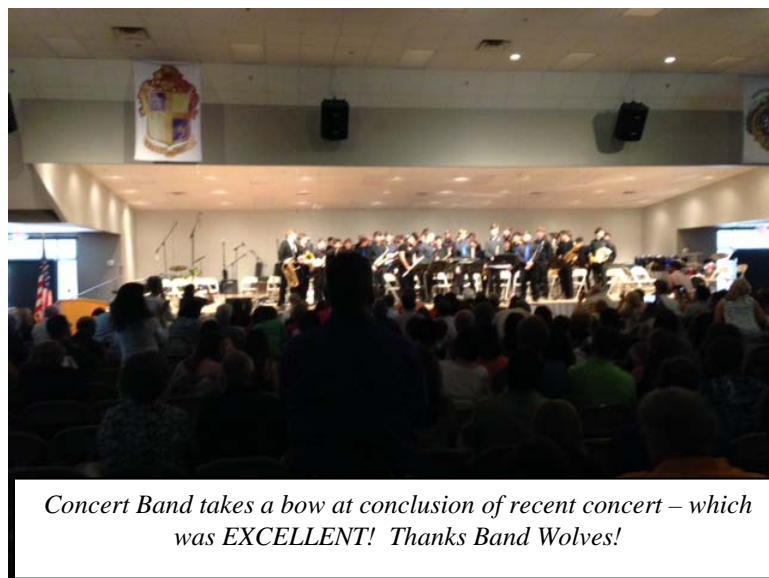
Concert Band takes a bow at conclusion of recent concert – which was EXCELLENT! Thanks Band Wolves!