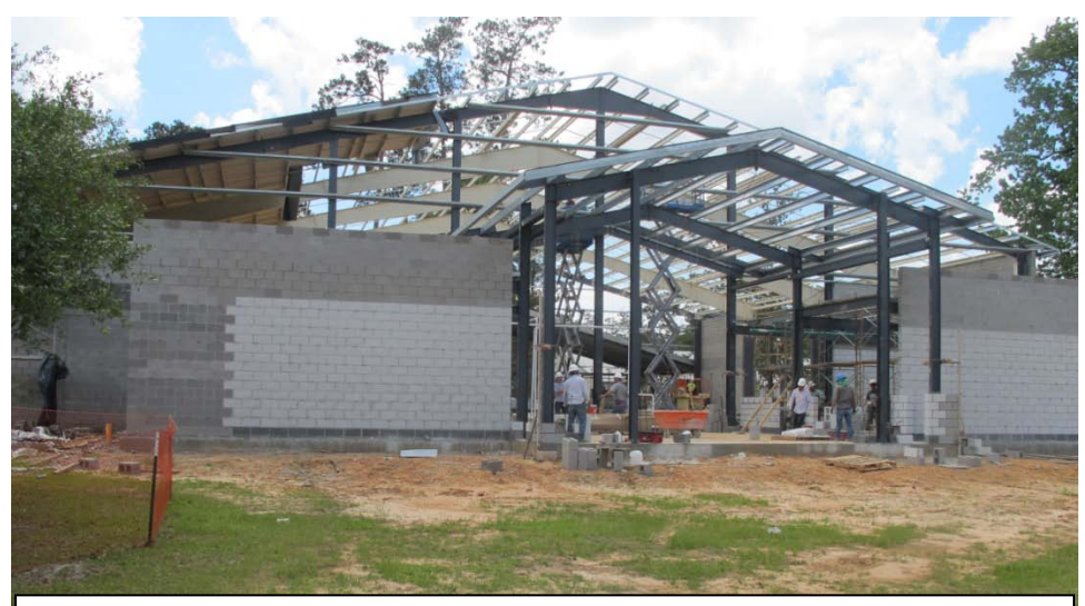
The new gym takes shape! Still trying to pay for it! Please help if you can! Naming opportunities available! See website or contact me! Thanks!

And Speaking of Next Year: Tuition invoices have been sent to returning students. Tuition is due by June 1. Bank loans must be secured by end of this week. Go to any branch of Resource Bank.