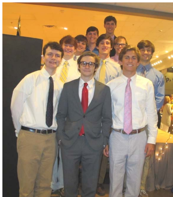
Ten seniors paid tribute to their moms at the Mother-Son Dinner last week.