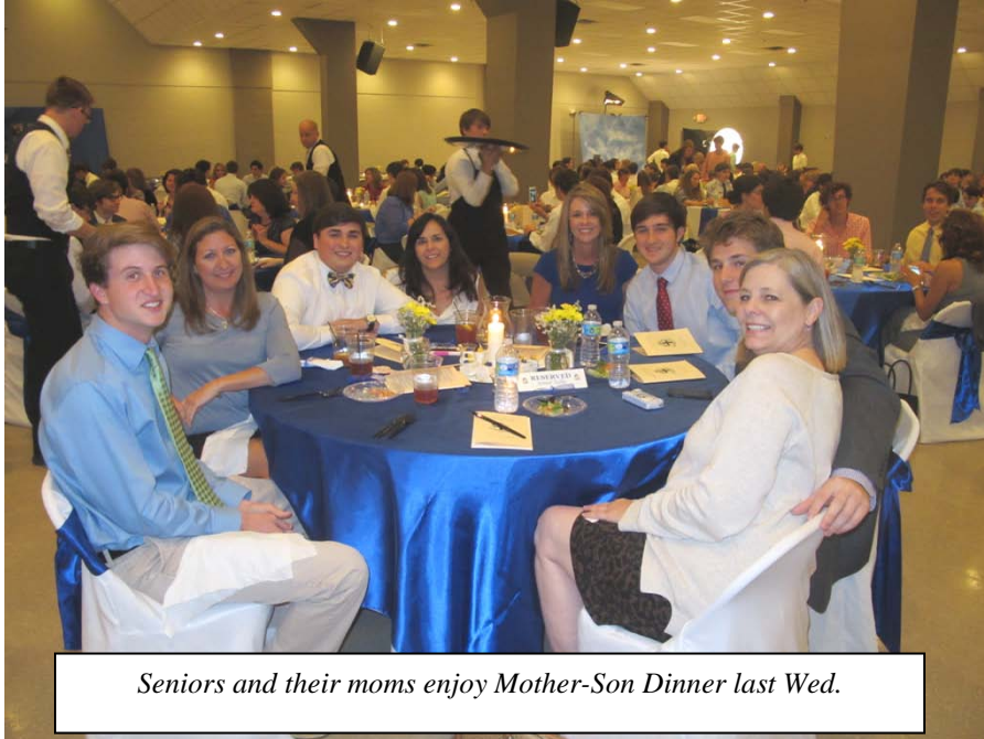
Seniors and their moms enjoy Mother-Son Dinner last Wed.

April 21 Assembly: I hope the students enjoyed our April 21 assembly. Here's some of what we did: