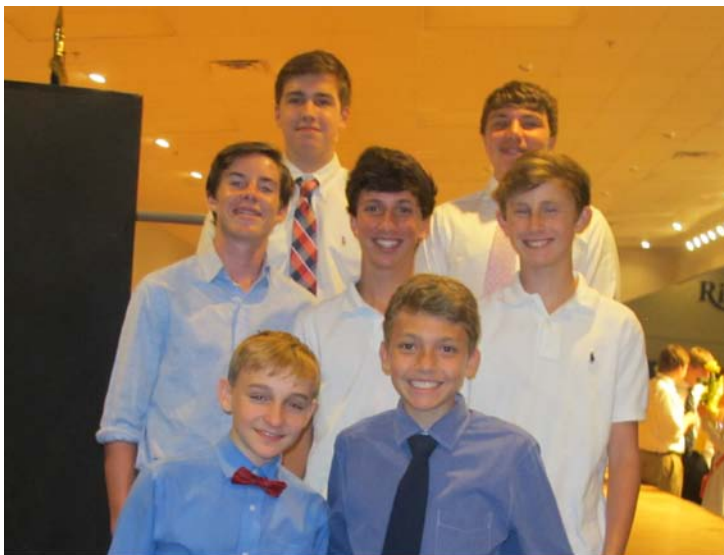
Pre-freshmen prepare to read perennial favorite "Love You Forever" at Mother-Son Dinner last week.