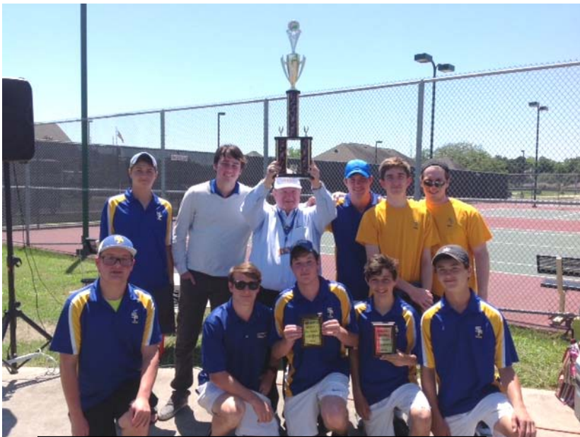
Congrats Regional Champion Tennis Wolves! We are proud of you!