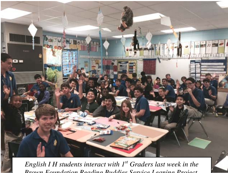
English I H students interact with 1 st Graders last week in the Brown Foundation Reading Buddies Service Learning Project.