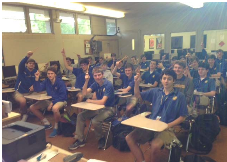
My English class celebrated National Pencil Day on Mar 30 with new, #2 pencils!

Catholics on end of life care issues. These are not always easy discussions, but important ones. I've done my "end of life" planning – although I hope my wishes won't be heeded anytime soon!