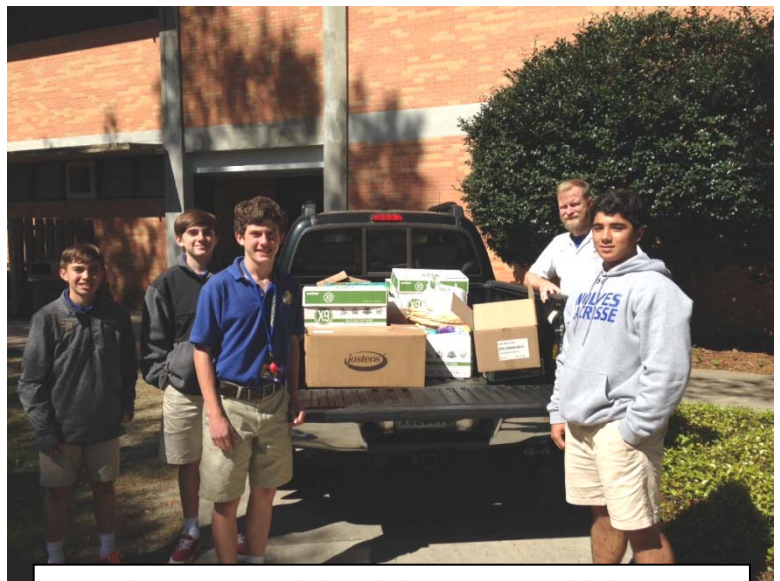
Wolves prepare to deliver baby items to Northlake Crisis Pregnancy Center on Holy Thursday.