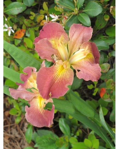
Iris are flowering all over the campus. Take time to admire their beauty. Thanks, Botanical Wolves!