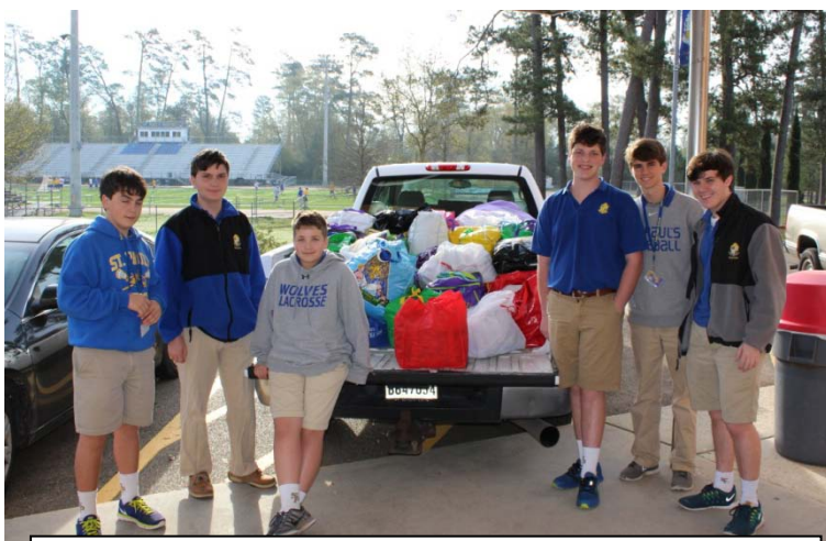
Wolves prepare to deliver a truck load of Mardi Gras beads to St. Michael's School.