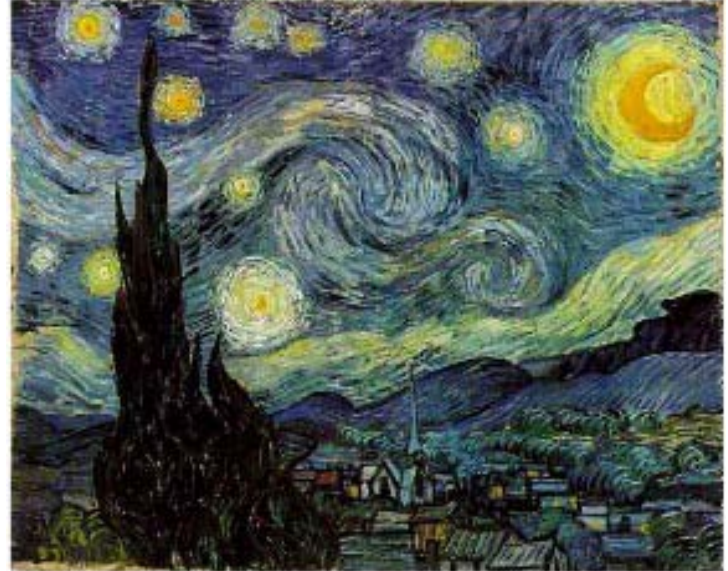
Van Gogh's "Starry Night"

Paper Wolf Update: Please encourage your students to read The Paper Wolf on line ( www.thepaperwolf.com ) and read it yourself. Compliment the staff. Subscribe. Support the future. TPW has had some fantastic stories lately!