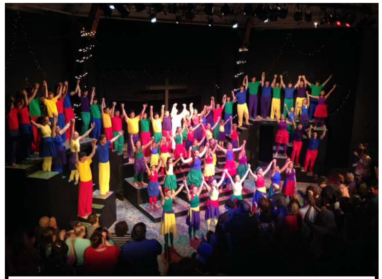
Marian Players receive a standing ovation as they conclude their run of "Godspell." Long live God!