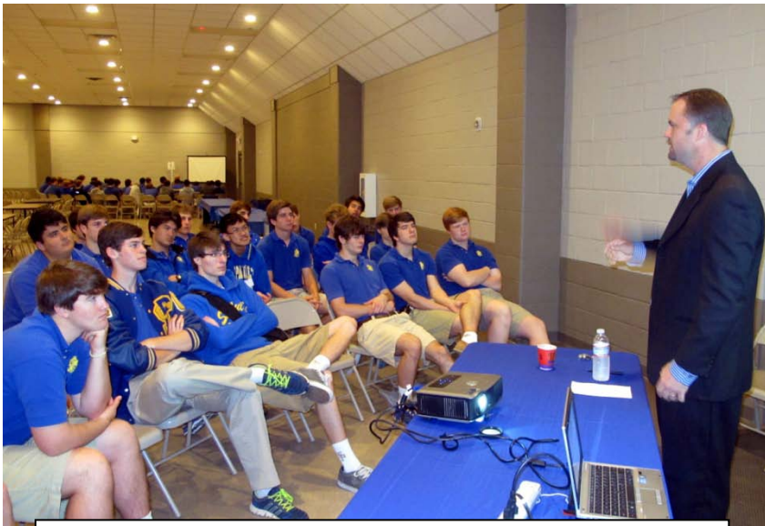
Seniors intently listen to practical financial literacy talk at Life Skills last week as they prepare for their post-SPS lives.

Mon, Apr 6 – 12: Easter Holidays (NOT spring break!) You are on your own for TDIH, National Whatever Days, and H of the W during the holidays!