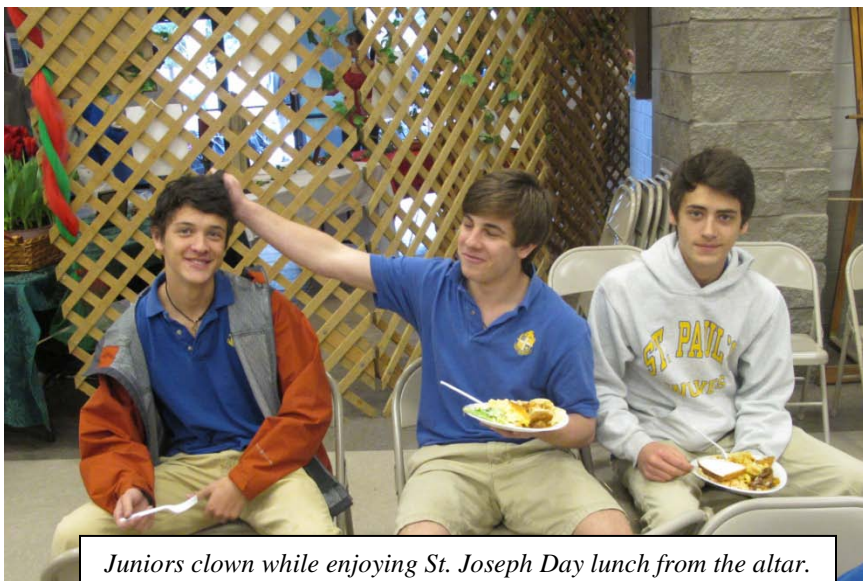
Juniors clown while enjoying St. Joseph Day lunch from the altar.

We congratulate St. Tammany on having the highest public school scores in the state. We humbly but proudly remind all, however, that Saint Paul's Class of 2014 had an average score of 25.9 – and we had all of our students take it, too!