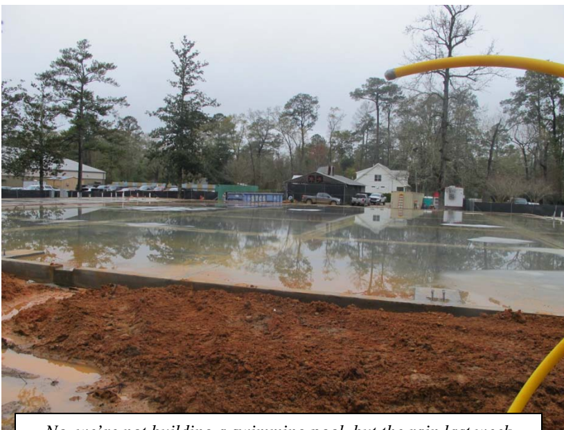
No, we're not building a swimming pool, but the rain last week turned the new gym slab into one.

Lenten Services: Religion classes have begun Lenten devotions at start of each block. Ask your son about them. Feel free to participate if you are on campus. Ask your son to sing "O That Shame!"