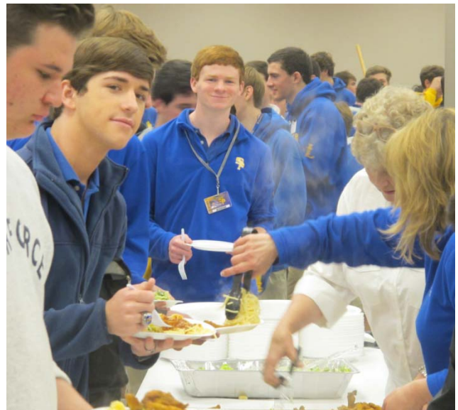
Seniors are served a delicious lunch (including fried catfish, several pastas, salads, vegetables and desserts) on St. Joseph Altar Day. Imagine feeding over 900 hungry students and faculty – all within 50 minutes!

March 17 – ACT for all juniors in BAC March 19 – Mass – Feast of St. Joseph March 25 – Life Skills Day for Seniors March 27 – Band and LYL at Team up Against Violence in Afternoon March 30 – Honors/AP Civics on field trip (Periods FGA) March 31 – President's Assembly – Teacher Appreciation Lunch April 1 – Passion Play Special Schedule April 2 – Mandatum Assembly - Easter Holidays begin at 3:00 April 13 – Leadership Week begins April 14 – History of Covington presentation to juniors (Per G) April 17 – Alumni Presentation assembly April 20 – Founder's Week begins April 21 – President's Assembly – Teacher Appreciation Lunch/Snack Day April 24 – Field Day (Only periods B&C meet) April 29 – Jazz Band field trip to LPO May 6-8 – Senior Exams May 12 – President's Assembly May 13-15 – Pre Freshmen Exams May 15 – Founder's Day Mass May 16 – Senior Graduation Ceremony (4 pm)