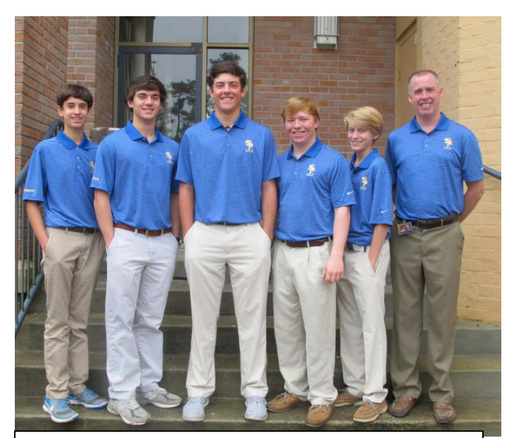
Northshore League-leading Wolves and their coach! The team includes two pre-freshmen! Geaux Wolves!

Important Driver's License Requirement: A new requirement was added to the driver's license issuance process for all minor applicants. All minor applicants must produce proof the applicant has either received a diploma or is currently enrolled in a high school program. This is done through a school attendance form from his or her high school prior to applying for a driver's license. These forms can be obtained in the administration building or the counseling center. Several students went for licenses over the holidays and were turned away because they didn't have the form – in some cases they waited several hours before being turned away!