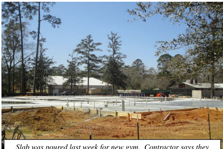
Slab was poured last week for new gym. Contractor says they are one day behind schedule. Naming opportunities still available! Just contact me! Thanks!

April 2 – Easter Holidays begin at 3:00 PM