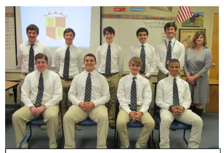
Newly inducted members of the Spanish Honor Society

Celebrity Waiters Dinner: Come celebrate "The Swing Era" at our 2015 annual Spring fundraiser, The Celebrity Waiters' Dinner, on Thursday, March 5 2015 in the Briggs Assembly Center from 6:00 to 10:00 pm. This fun filled evening includes a full course meal, refreshments, entertainment and fellowship amongst St. Paul's families as well as the local business community. Proceeds from this event directly impact our students while supporting the College Tour, the student chapter of Habitat for Humanity, honor roll breakfasts and other special student recognitions, Life Skills Day for Seniors, etiquette training for pre- freshmen,