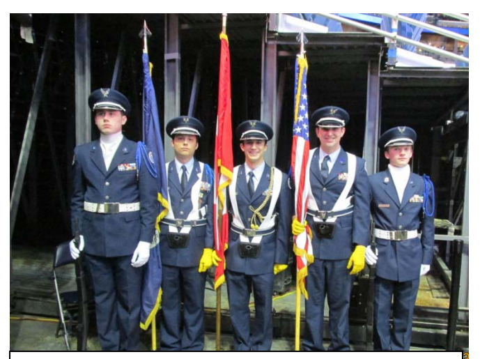
LA 41<sup>st</sup> Color Guard presents colors at Pelicans' game last week. Since the Pels were playing the Toronto Raptors, the Canadian flag was also presented.