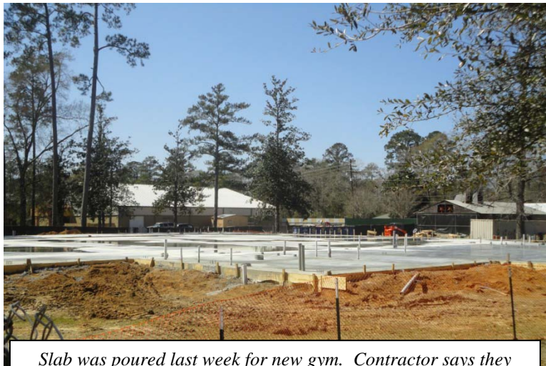
Slab was poured last week for new gym. Contractor says they are one day behind schedule. Naming opportunities still available! Just contact me! Thanks!

April 2 – Easter Holidays begin at 3:00 PM