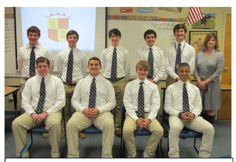
Newly inducted members of the Spanish Honor Society

Celebrity Waiters Dinner: Come celebrate "The Swing Era" at our 2015 annual Spring fundraiser, The Celebrity Waiters' Dinner, on Thursday, March 5 2015 in the Briggs Assembly Center from 6:00 to 10:00 pm. This fun filled evening includes a full course meal, refreshments, entertainment and fellowship amongst St. Paul's families as well as the local business community. Proceeds from this event directly impact our students while supporting the College Tour, the student chapter of Habitat for Humanity, honor roll breakfasts and other special student recognitions, Life Skills Day for Seniors, etiquette training for pre- freshmen,