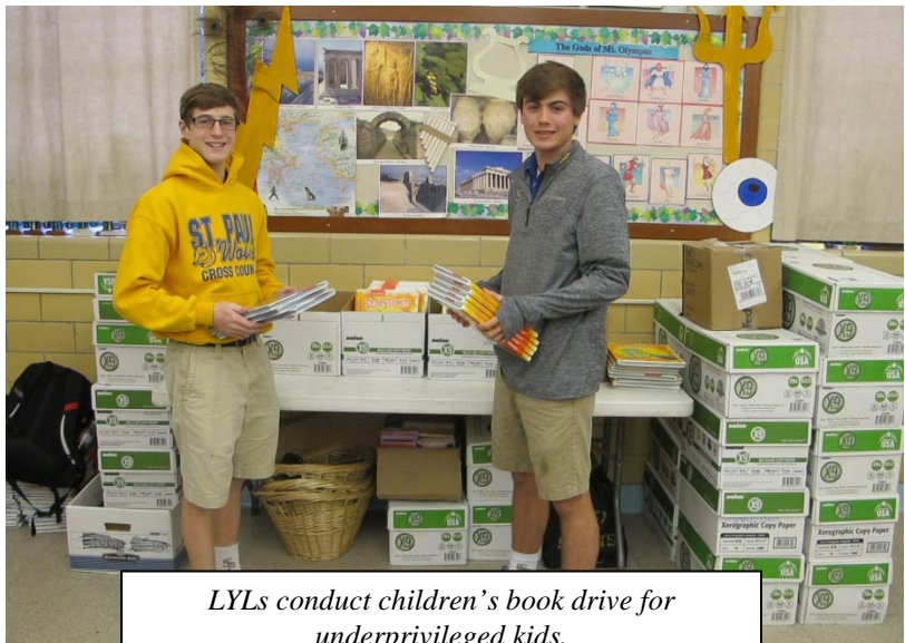
LYLs conduct children's book drive for underprivileged kids.