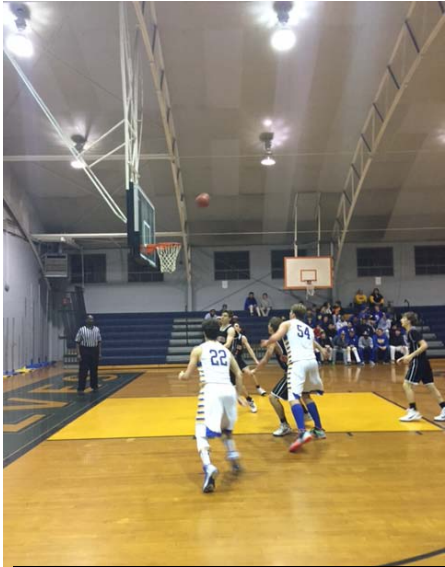
SPS dominates over F'Bleau. And, yes, the ball went in!