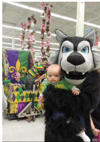
The Wolf charmed everyone during Mardi Gras.