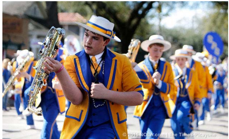
Marching Wolves strut their stuff at Mardi Gras.