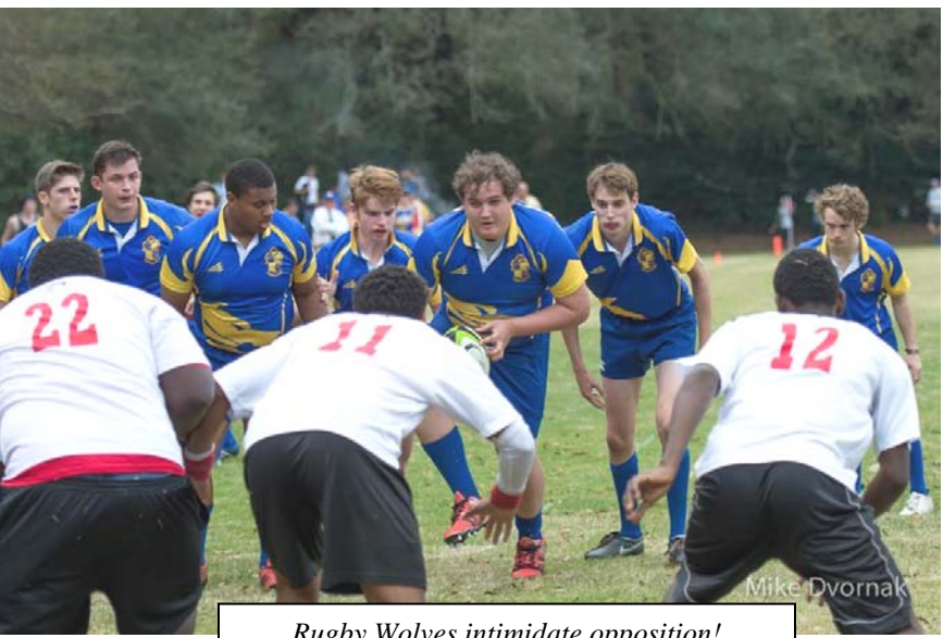
Rugby Wolves intimidate opposition!

Recognized and congratulated SPS Rugby team, which had opened its season the weekend before with a 41-0 victory over West Jefferson. The victory showed great promise for this year's Rugby Wolves.