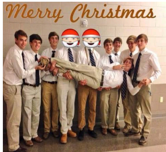
Soccer Wolves get creative with Christmas card.

Welcome to January: Here are some of the causes celebrated in January: Apple and Apricots Month, Artichoke and Asparagus Month, Bath Safety Month, Be Kind to Food Servers Month, Birth Defects Month, California Dried Plum Digestive Month, Celebration of Life Month, Financial Wellness Month, Get A Balanced Life Month, Get Organized Month, International Creativity Month, National Clean Up Your Computer Month, National Glaucoma Awareness Month, National Hot Tea Month, National Mentoring Month, National Polka Music Month, National Poverty in America Awareness Month, National Soup Month, National Volunteer Blood Donor Month, Oatmeal Month, Rising Star Month, Shape Up US Month, Teen Driving Awareness Month, Tubers and Dried Fruit Month, Thyroid Awareness Month, & Worldwide Rising Star Month. Something for everyon