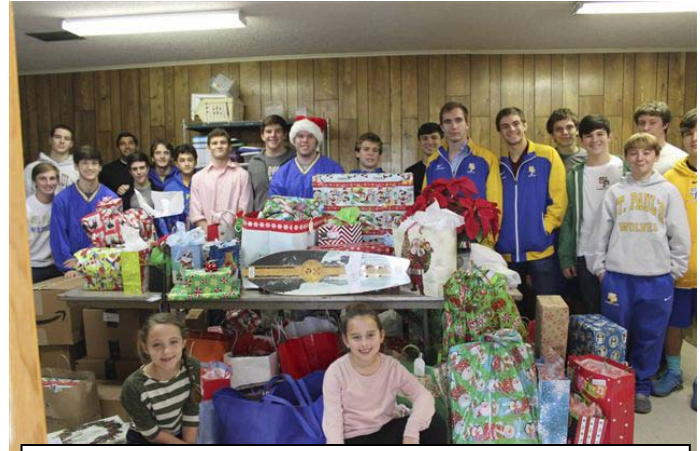
Wrestlers have a party for Fairhaven Children’s Home