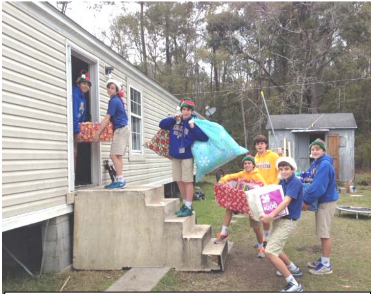
Pre-freshmen Elves deliver gifts to their adopted family.

Annual Fund: Many thanks to those who have responded to my request. For clarity, I offer the following: