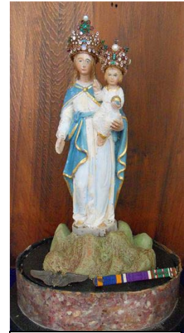
Original OLPS brought from France in 1727 by Ursuline nuns.