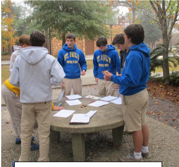
Wolves collaborate in learning.

Thanksgiving to Christmas: This period of the school year can be a real challenge. While it should be a time of good will and cheer, often we find ourselves handling a crisis. The best way to prevent any difficulty is through the Lasallian virtues of caring and vigilance – which will be in full force. Teachers will teach until the very end. Parents, please remind your students to adhere to ALL procedures & policies. We will show care to the students, but we will be vigilant.