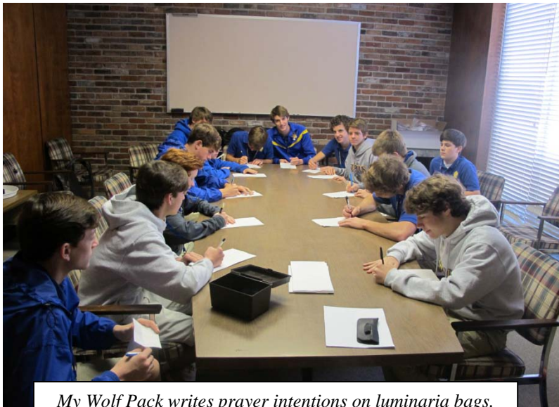
My Wolf Pack writes prayer intentions on luminaria bags.