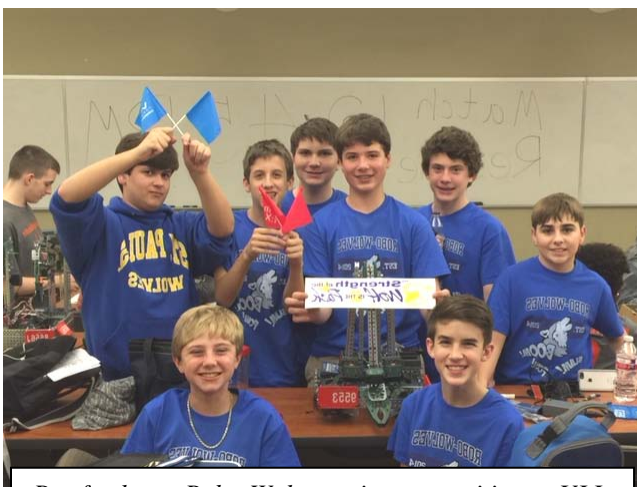
Pre-freshmen Robo-Wolves enjoy competition at ULL.