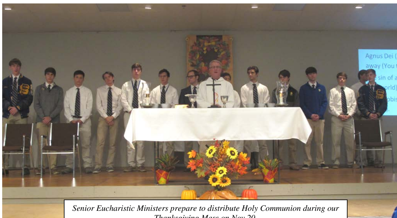
Senior Eucharistic Ministers prepare to distribute Holy Communion during our Thanksgiving Mass on Nov 20.

January 28 – 11 th Grade HR Breakfast January 29 – Career Day – 9 th Grade HR Breakfast January 30 – 8 th Grade HR Breakfast February 2 – 9:00 AM late start for Faculty In-Service/ Parent-Teacher meetings 5-7 PM February 3 – President’s Assembly February 10 – Mass Schedule February 13 – Teacher Retreat February 26-27 Junior Retreat/Angola Trip March 3 – Teacher Appreciation Day/Snack Day March 5 – Celebrity Waiter Dinner March 6 – 9:00 AM late start for teachers and students March 9 – St. Joseph Altar – all periods meet (FGABCDE) March 10 – President’s Assembly March 13 – Third Quarter Ends