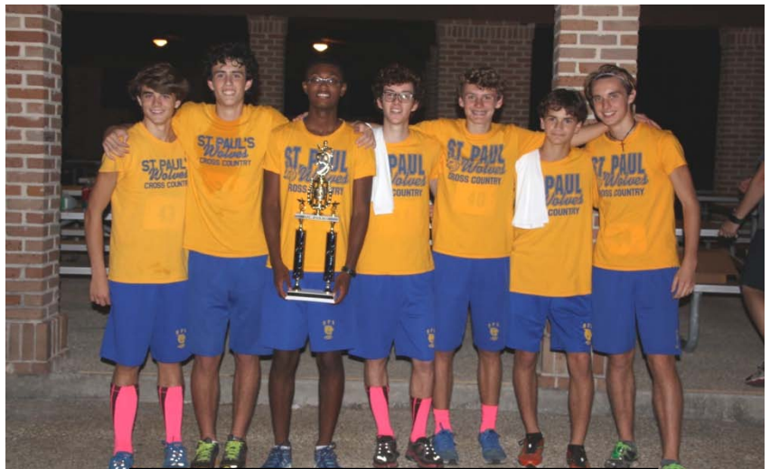
District Champion Cross Country Wolves!