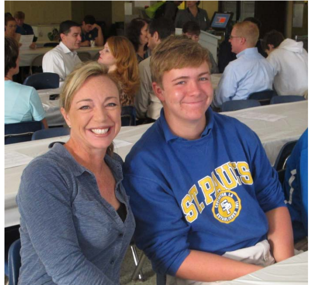
A sophomore wolf and his mom enjoy Honor Roll Breakfast last week