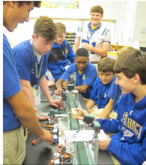
Pre-freshmen engaged in Hornbeck Offshore Gateway to Technology program