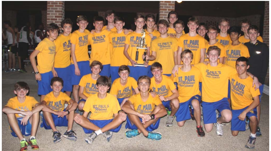
JV Cross Country were District Champions, too! The future of SPS CC looks bright!