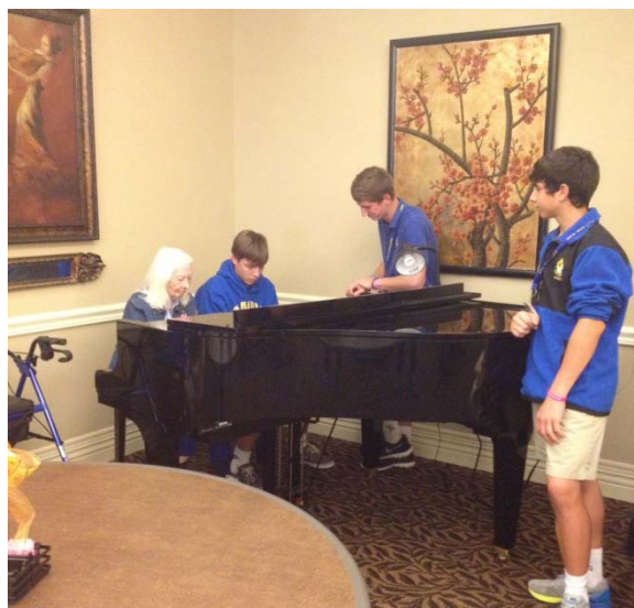
Freshmen Wolves interact with residents of Forest Manor during last week’s service day.