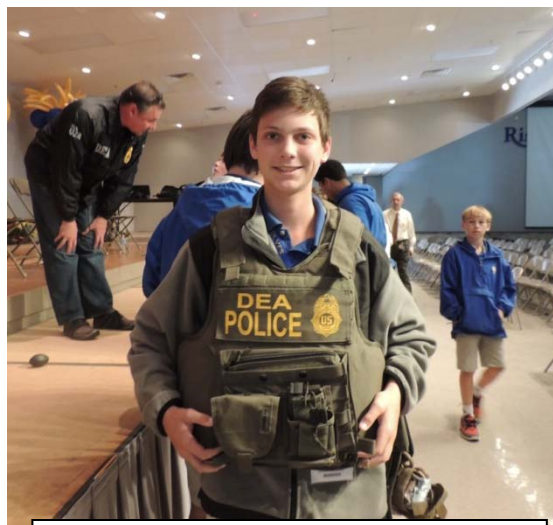
A Wolf considers a career with the DEA after last week's Red Ribbon Assembly.