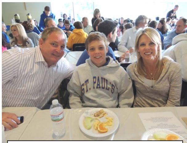
A Wolf's parents celebrate his honor roll at last week's Honor Roll breakfast.