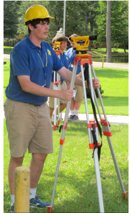
Future engineers in our Hornbeck Offshore Engineering Program survey the campus with equipment donated by FLWB architectural firm.

Still Learning New Things as the 17 th Christian Brother President of Saint Paul's School