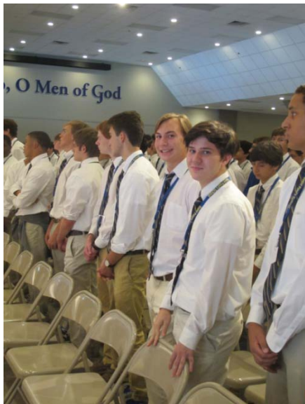
Students in dress uniform