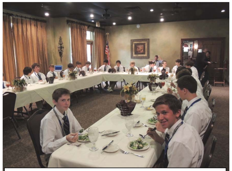
The first group of Pre-freshmen learns etiquette & enjoys fine dining last week at N'Tini's in Mandeville.