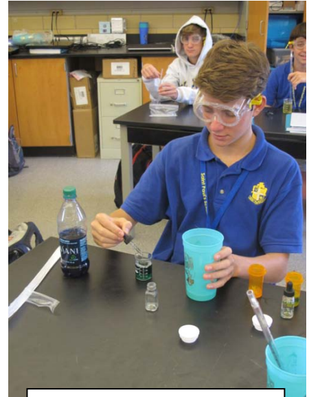
Future scientist at work!