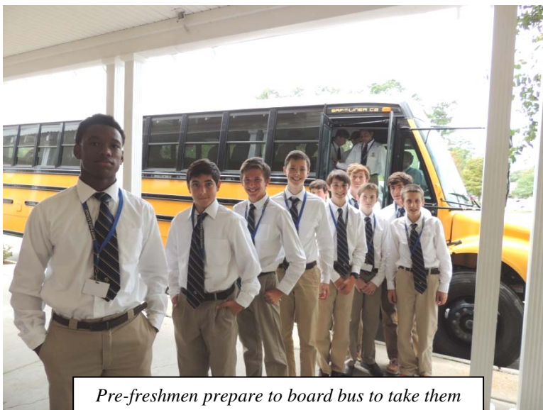
Pre-freshmen prepare to board bus to take them to etiquette training – and lunch!