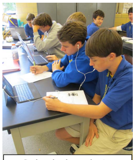
Students hard at work using technology and sharing music!

October: Welcome to the month of October – the tenth month of the year, even though "octo" means eight. I hope you know why this discrepancy exists! In any event, I draw the following to your attention as we begin October: