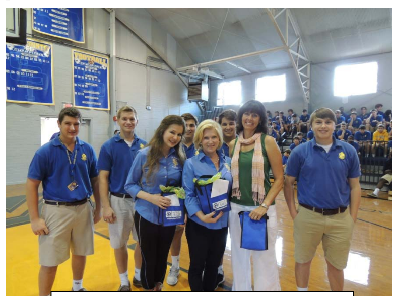
Botanical Wolves are honored at assembly.