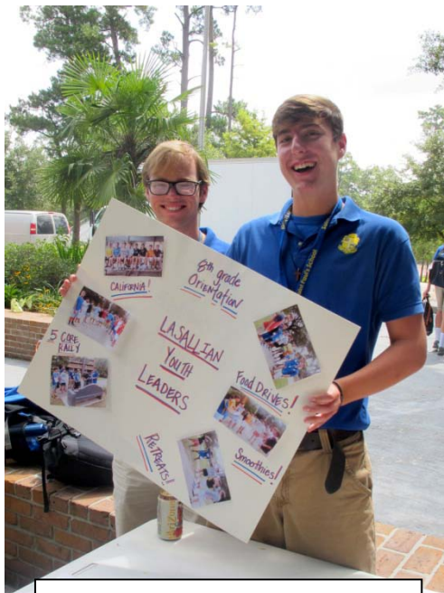
LYLs recruit new members!