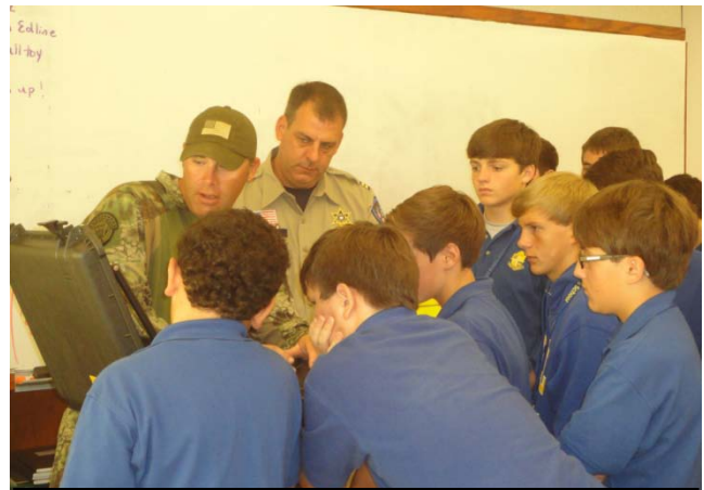
Pre-freshmen intently watch a robotics demonstration by St. Tammany Parish Sheriff's Office.