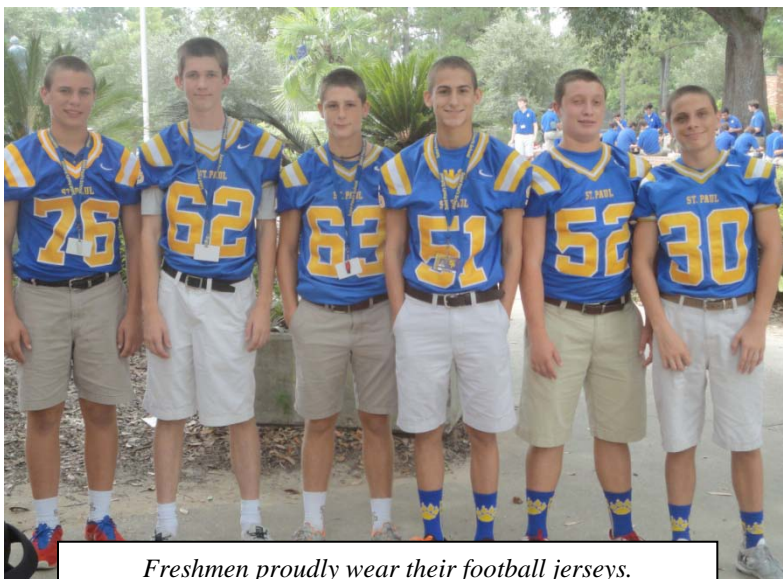
Freshmen proudly wear their football jerseys.

to do so: http://www.stpauls.com/support/events/jazz-n-roll/jnr-order/ Contact the Advancement Office (892-3200, ext 1270, for more info.