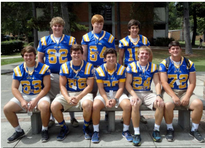
Seniors prepare for the Christian Brothers Jamboree and proudly wear their game jerseys.