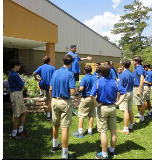
A senior LYL member addresses Pre-freshmen at recent Five Core Rally.