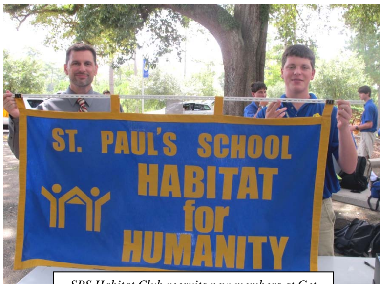
SPS Habitat Club recruits new members at Get Involved Day!