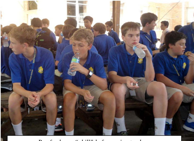
Pre-freshmen "chill" before going to class.