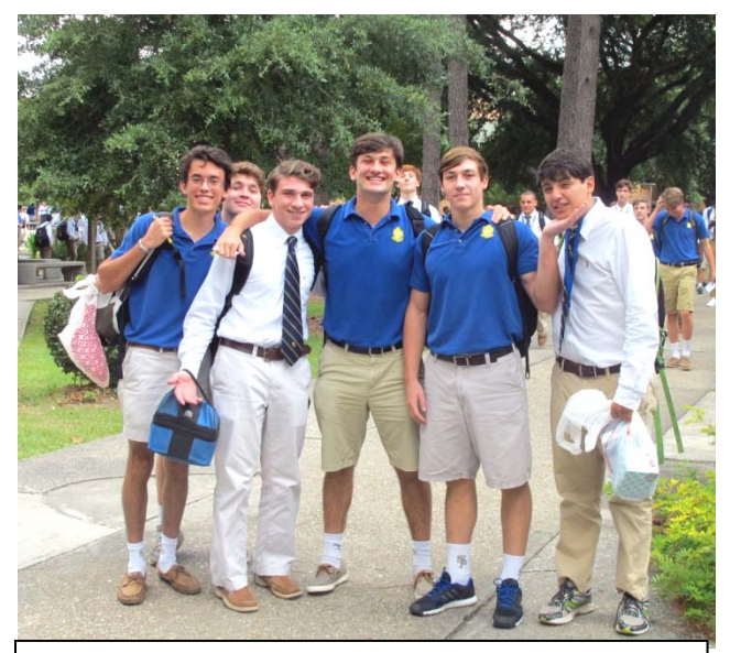
Students show their joy at being back at school!

Helping Saint Paul's: Don't forget – If you shop at Office Depot, please give the SPS school code (70041640) and SPS receives 5% of your purchase!