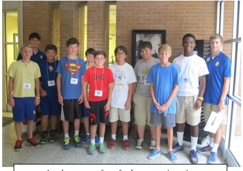
Another group of pre-freshman at orientation

New LA Laws: In case you weren't aware, the following legislative acts became law on Aug 1: