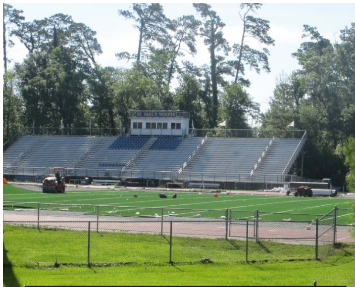
Turf field warranty replacement job nears completion.