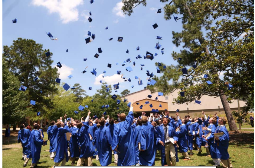
Graduates celebrate at end of ceremony!