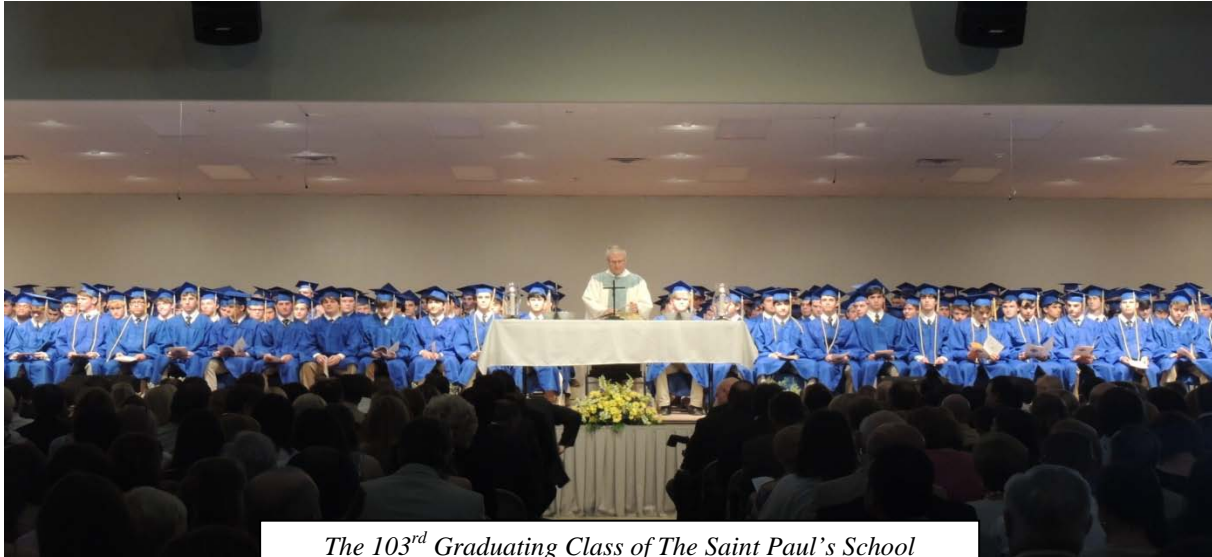
The 103 rd Graduating Class of The Saint Paul's School

My last newsletter (I can hear you cheering!) will be brief. My final Lasallian thought is the same one I use every year at this time: a short excerpt from Saint John Baptist de La Salle's last Meditation for the Time of Retreat to the Brothers entitled: On the reward that a Brother should expect in heaven, if he is faithful in the work. Saint La Salle wrote this meditation because the life of the early brothers was VERY hard – and he needed to assure them that they would one day be rewarded by Almighty God. He made sure they read this meditation every year.