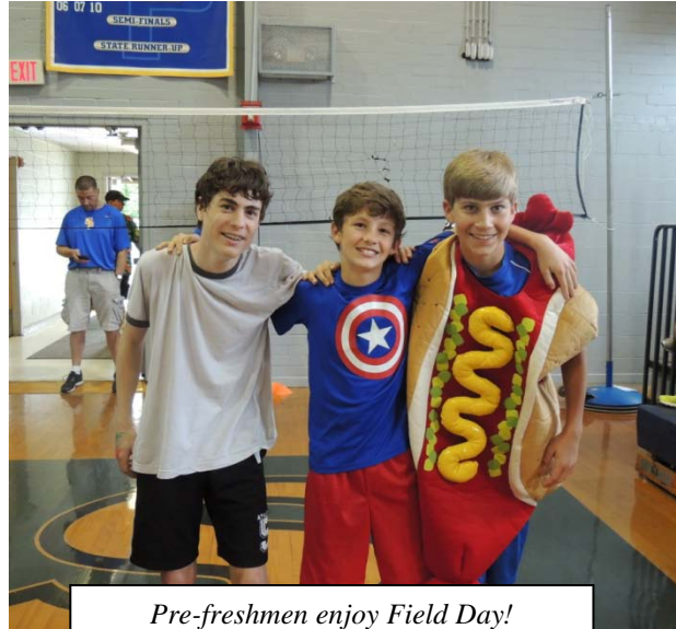
Pre-freshmen enjoy Field Day!

WE NEED GRANDPARENT SUPPORT! Several grandparents approached me on GP Day about donating and asked why they aren't solicited like other schools do. I replied that we need and welcome their support and they all replied that they would contribute. If you would like to inform your son's grandparents of the drive, please do so – or provide me with an address and I'll personally appeal. I'll send them a nice "thank you" note, too! Even a small donation ($5!) is welcome.