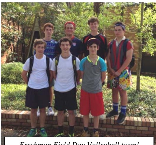
Freshman Field Day Volleyball team!

And while I'm on a rant, some parents told us that they their son was going to some party but didn't know what was going on. HEEELLLLLLOOOO? If he's going to a vacant piece of property, it's not to play scrabble. Parents, PLEASE be aware of what your son is doing. Please insist that he not participate in illegal activity. Please monitor his social media sites – and know that in some cases he's got more than one – the one he lets you see and the one he doesn't. And PRAY!