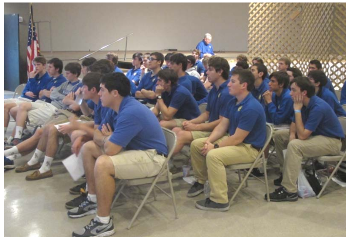
Seniors listen intently at Life Skills Day.