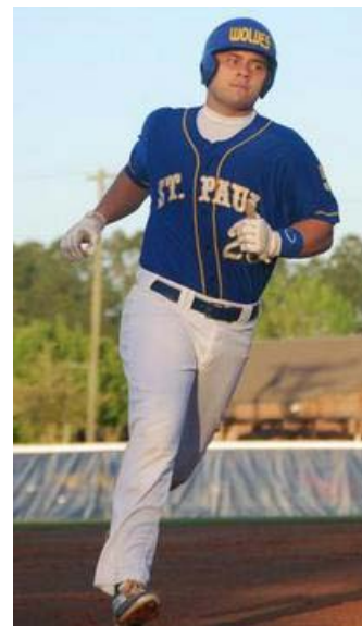
Handsome rounds bases in big week for BB Wolves