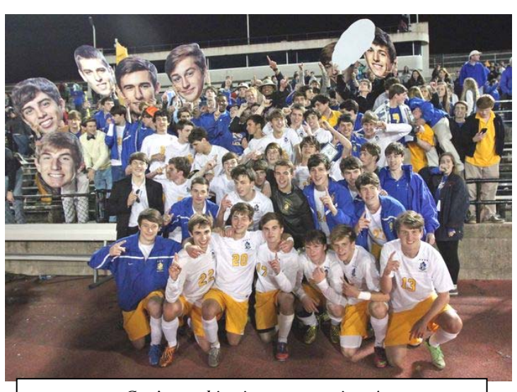
Can't see this pic too many times! We are proud of you, State Champion Soccer Wolves!