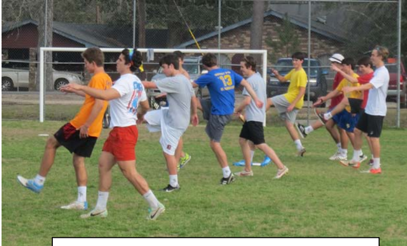
Ultimate Frisbee Wolves warm up before practice.