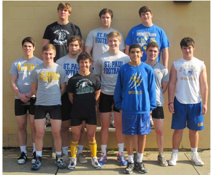
SPS's Formidable Power Lifting Team poses informally after a recent practice.

Sweatshirts & Cold Weather: With the exceptionally cold weather lately, we relaxed our rule and allowed heavy coats and other warm weather gear. Now that things are more seasonal, we return to policy: ONLY SPS cold weather wear is accepted. If this presents a problem, please contact me. We have some pre-owned sweatshirts in good condition which I’ll be happy to distribute. Nothing will be done to embarrass your son.