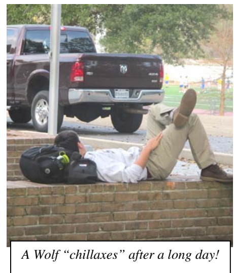
A Wolf "chillaxes" after a long day!