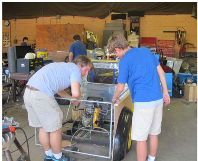
Wolves on Wheels work diligently on their entry into the Eco Car Marathon.