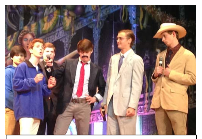
Student Council performs skit at recent LA Assoc of Student Council Convention.