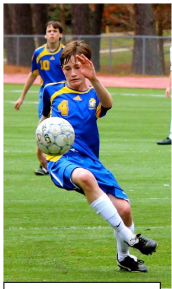
#4 prepares to contact the soccer ball in a recent 8<sup>th</sup> grade game.

Sweatshirts & Cold Weather: With the exceptionally cold weather last week, we relaxed our rule and allowed heavy coats and other warm weather gear. Now that things are more seasonal, we return to policy: ONLY SPS cold weather wear is accepted. If this presents a problem, please contact me.