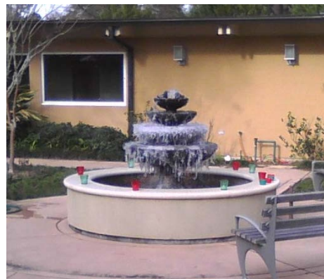
Ice forms on fountain in Brothers' patio due to last week's freeze.