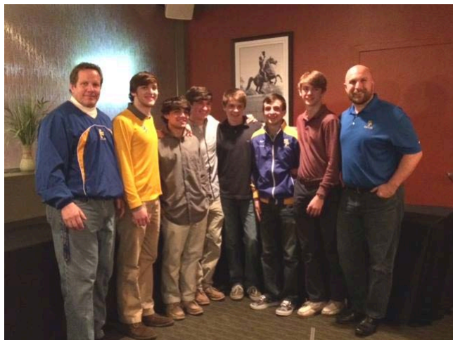
Wrestlers were interviewed on local radio last week and acquitted themselves in an exemplary fashion.

Honor Roll Breakfasts: Second quarter HR breakfast schedule is published below. All breakfasts last from 7:40-8:20. Note: HR is determined by second quarter grades, not semester grades.