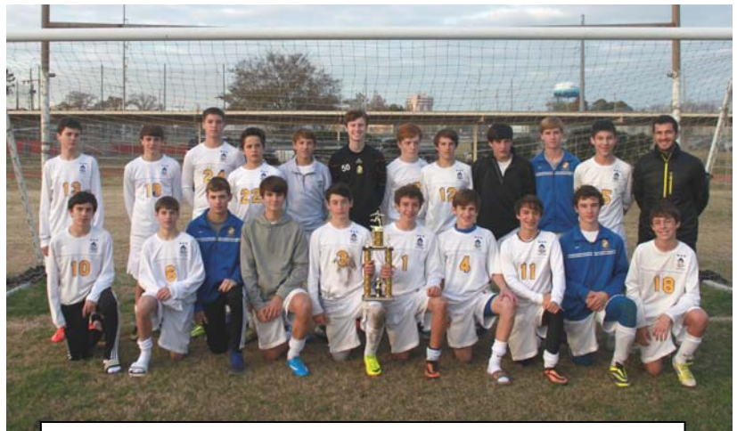
9 th Grade Soccer Wolves win Rummel Tournament by defeating Rummel, Brother Martin & Jesuit.