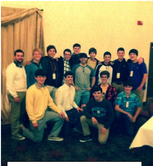
SPS was well-represented at the CCRNO retreat Jan 3-6.