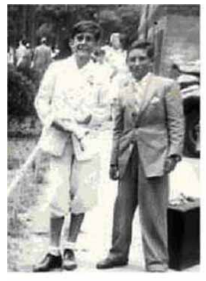
Saint Paul's 7th Grade Graduation 1941