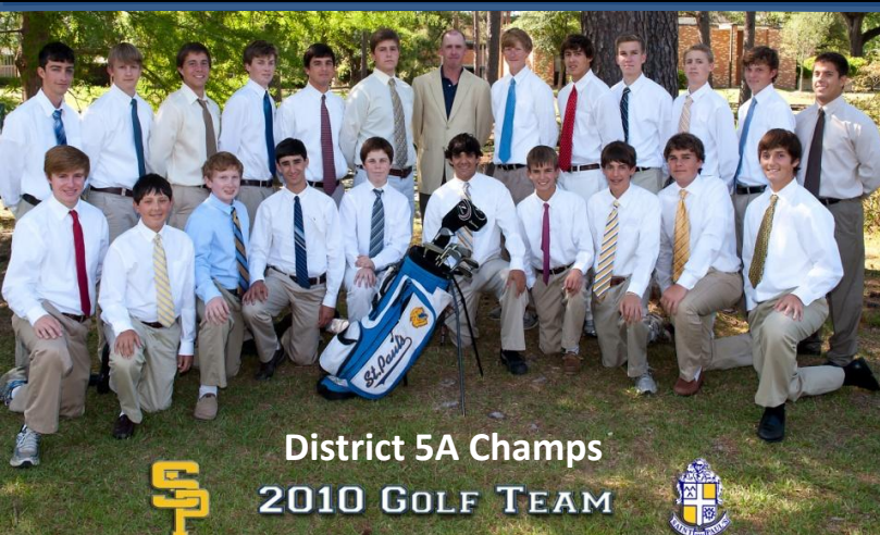
District 5A Champs 2010 GOLF TEAM

RSVP to Jimmy Dykes '61 at alumni@stpauls.com for June 4 th and June 5 th dates.