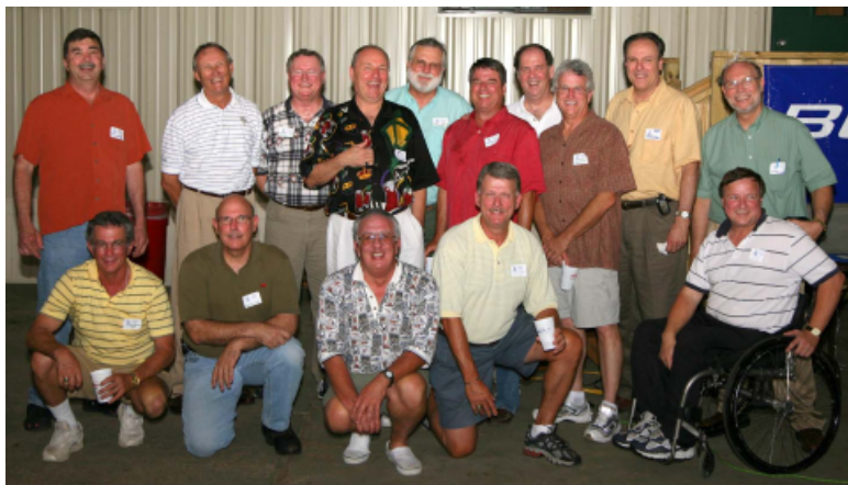
Class of 1968