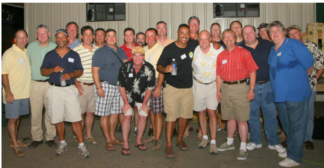
Class of 1978