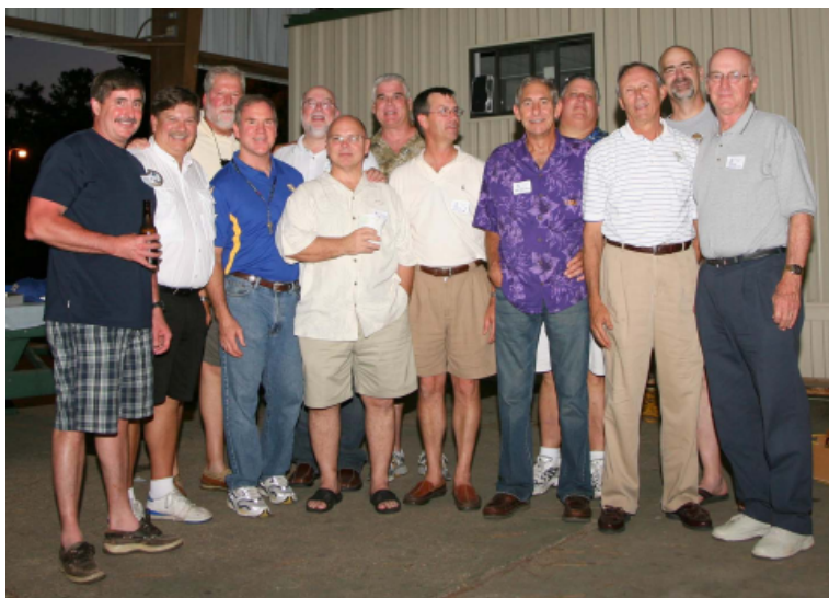
Class of 1973