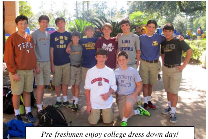
Pre-freshmen enjoy college dress down day!