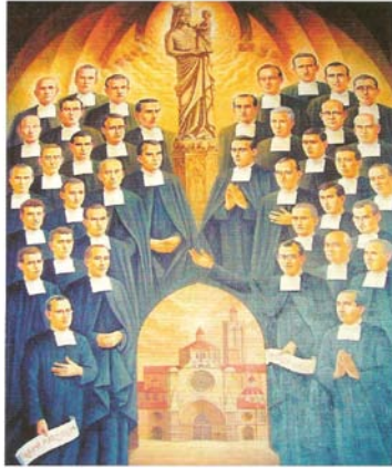
Brothers Martyrs of Tarragona