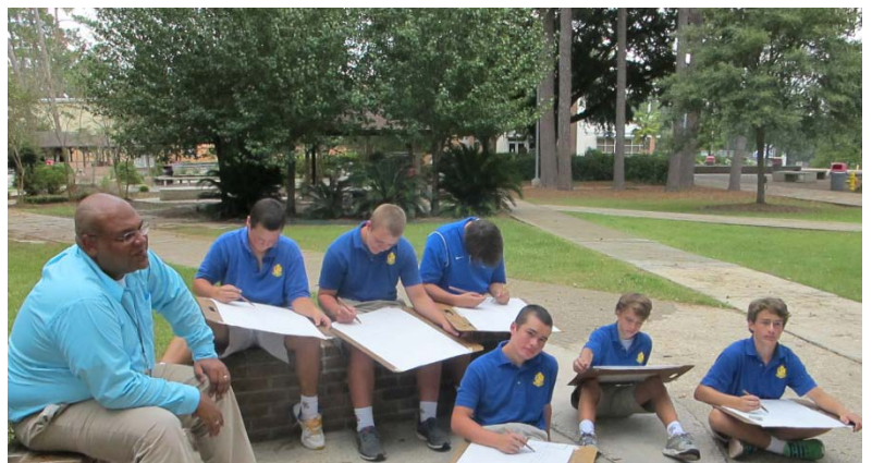
Art Class Wolves hard at work

On September 23, 1810, a group of rebels took the Spanish garrison at Baton Rouge and unfurled the Bonnie Blue Flag of the Republic of West Florida. By the 17th century, Spain and France had divided up the Gulf Coast from Florida to Louisiana. In 1763, at the end of the French and Indian War, France and Spain ceded a bunch of territory to Britain, with Britain taking everything from Florida to Louisiana east of the Mississippi. (Spain got the rest of Louisiana, including New Orleans). Britain split its new holdings into East and