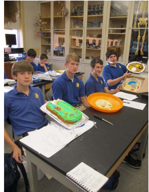
More edible cells in biology