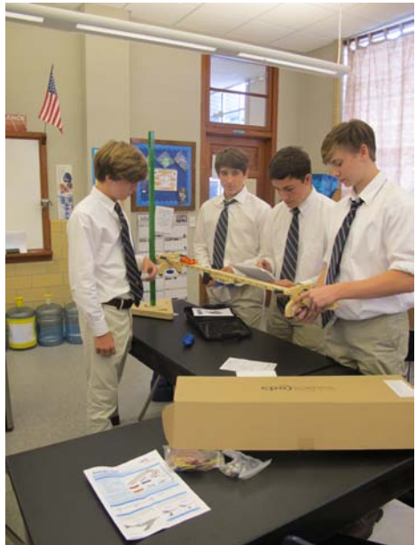
Engineering wolves at work

http://theadvocate.com/news/7112298-123/archbishop-requiring-catholic-schools-to .