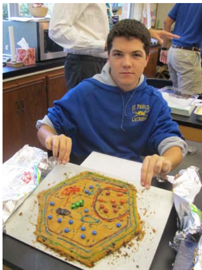
Student poses with his edible cell in biology.