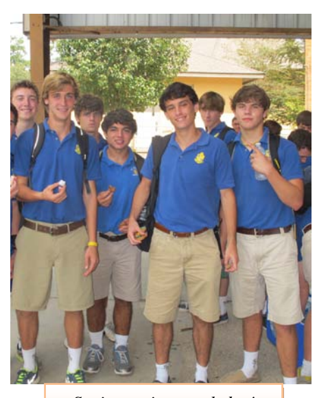
Seniors enjoy snack day!